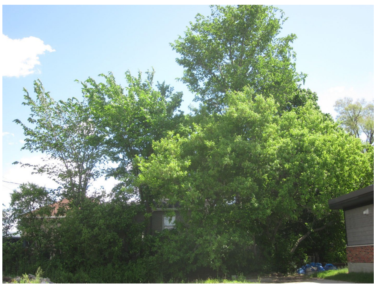
Picture 2. Trees #2-5 (left to right), private, shared, and neighbouring maples and elms at 1353 Gosset Street.