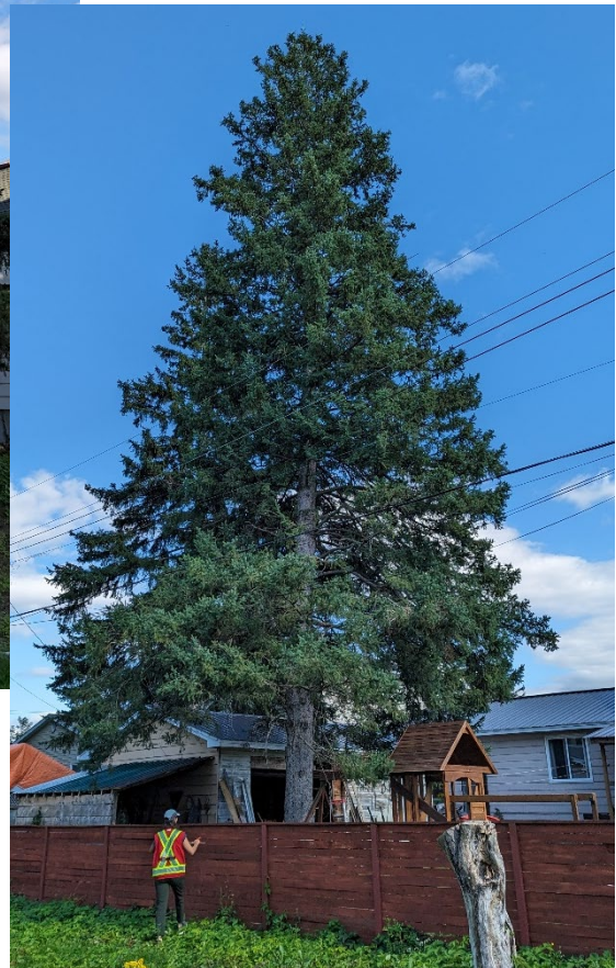
Right: Tree 5 - Adjacent spruce to be retained.