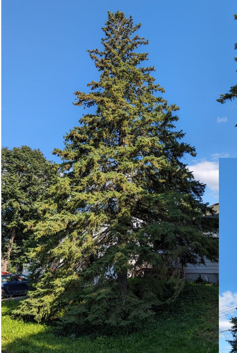
Above: Tree 1 - private spruce to be retained.