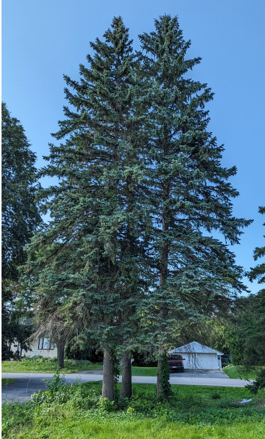
Trees 2-4 - private spruces to be removed.