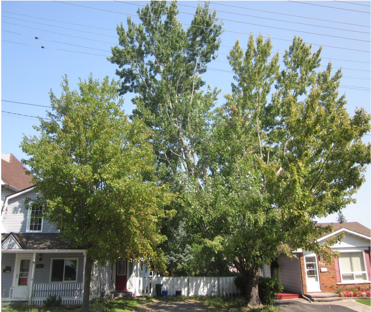
Picture 1. Trees #1 and 2 (right to left), in front of 285 Montford Street

By signing the application you are acknowledging and understanding that a city forestry inspector or municipal law enforcement officer may enter the property at a reasonable time for the purpose of carrying out an inspection. You also acknowledge and understand that through failure to abide by the recommendations of the approved Tree Information Report, damaging or destructing trees identified for protection, you alone will be responsible to bear fully the cost of compensation, removal, and replacement. Further, you are acknowledging having read and agreed to the Limitations of Tree Assessments and Liability included at the end of this report.