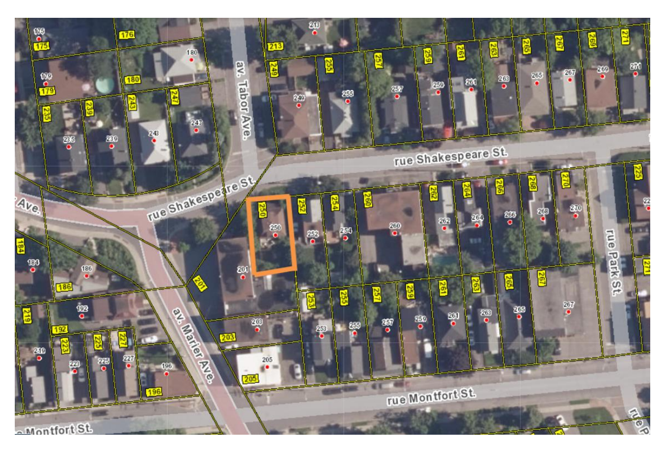
Figure 1 – Aerial view of the subject property, 250 Shakespeare Street

Figure 1 shows an aerial view of the subject property outlined in Orange. As shown in the aerial image, the surrounding land uses are predominantly residential. A small commercial use exists directly adjacent to the subject property at 201 Marier Avenue.