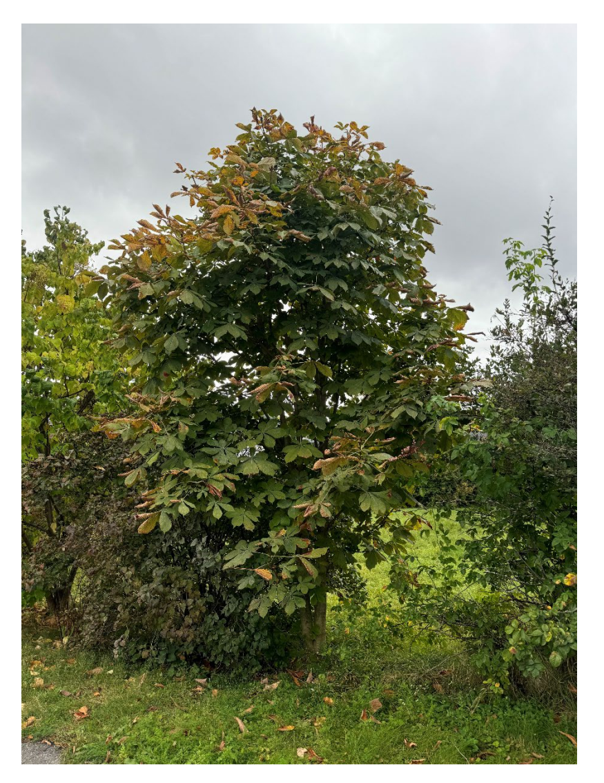
Figure 3: Tree 6, horsechestnut