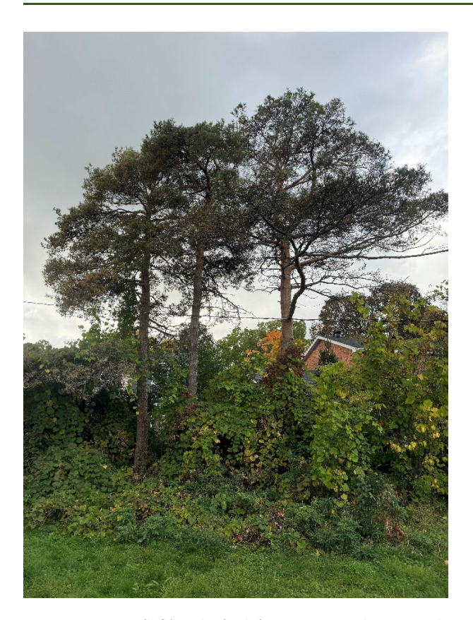
Figure 1: Trees 1 (left) and 2 (right), Scots pine to be retained