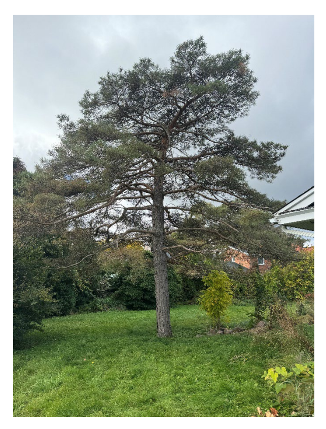
Figure 2: Tree 3, Scots pine to be removed as part of future development