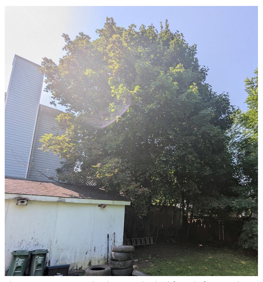
Above: Tree 1 - Norway maple to be removed. Below left: trunk of Tree 1. Below right: 1st union of Tree 1 with included bark and seam