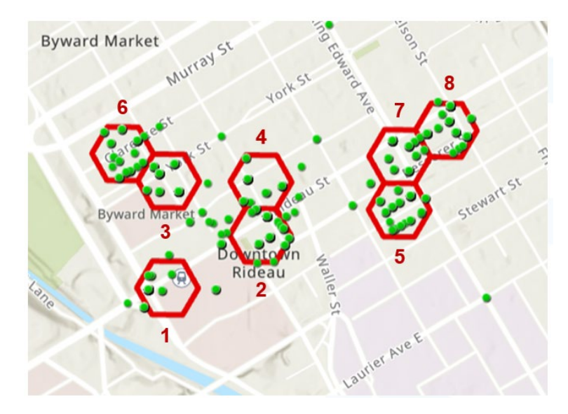
Hot Spot related police calls for service in the 8 high priority hexagon areas

During this period, officers recorded 972 community interactions and only 21 arrests, highlighting the priority of community engagement over strict law enforcement. Interactions ranged from check-ins with residents and businesses to more involved assistance for individuals in need.