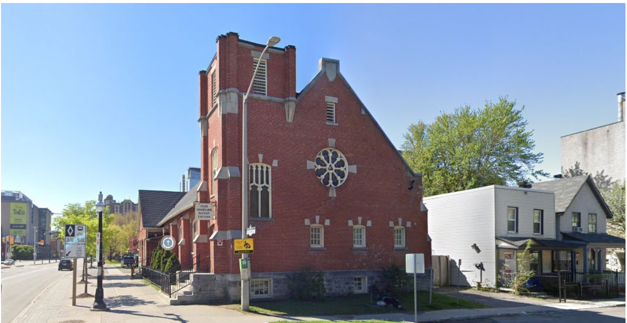
Église évangélique baptiste d'Ottawa, King Edward Avenue at Clarence Street.