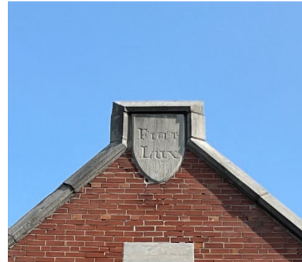
North façade.