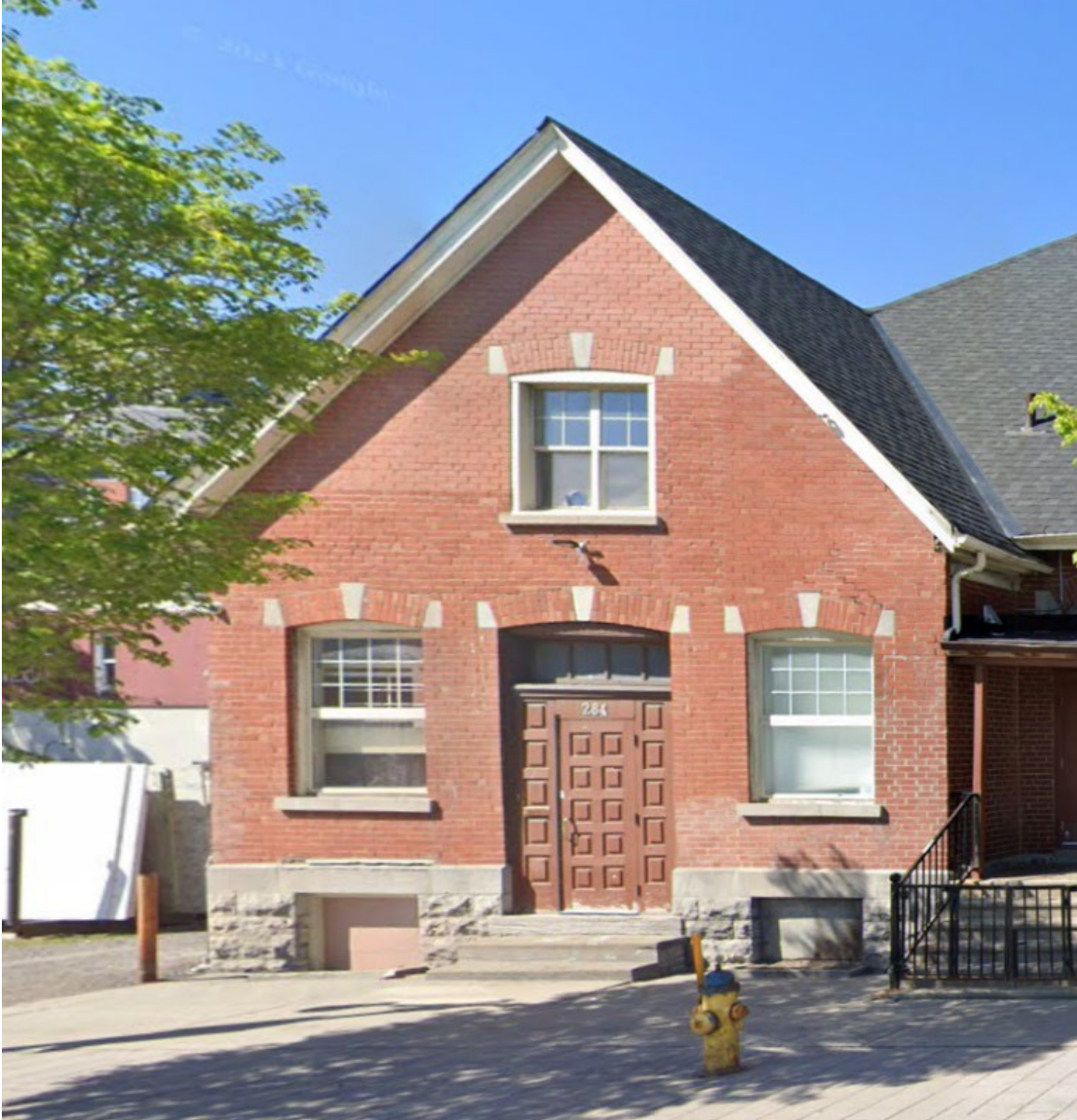
Gospel Hall of the Église évangélique baptiste d'Ottawa.