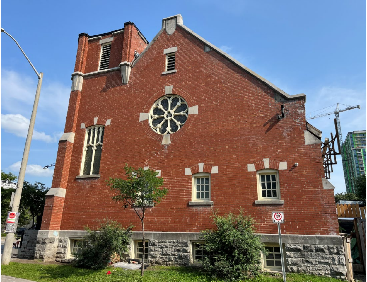
North façade of the Église évangélique baptiste d'Ottawa.