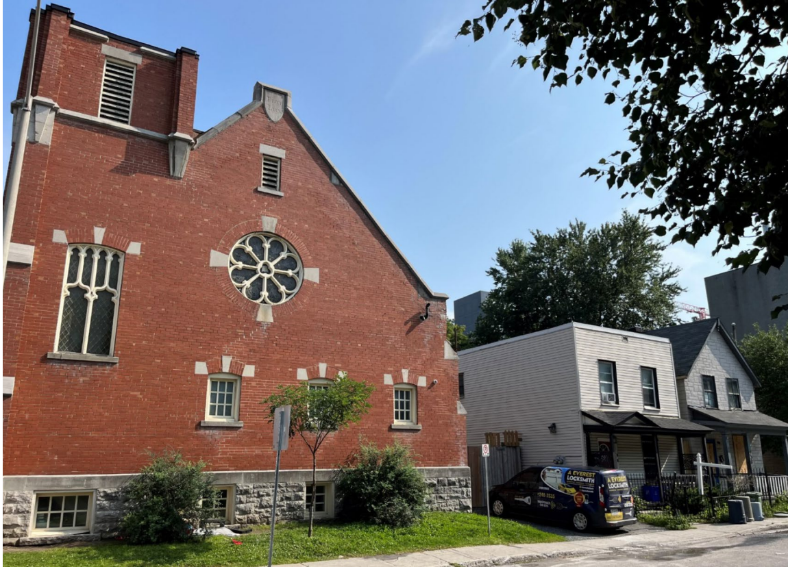
South side of Clarence Street.