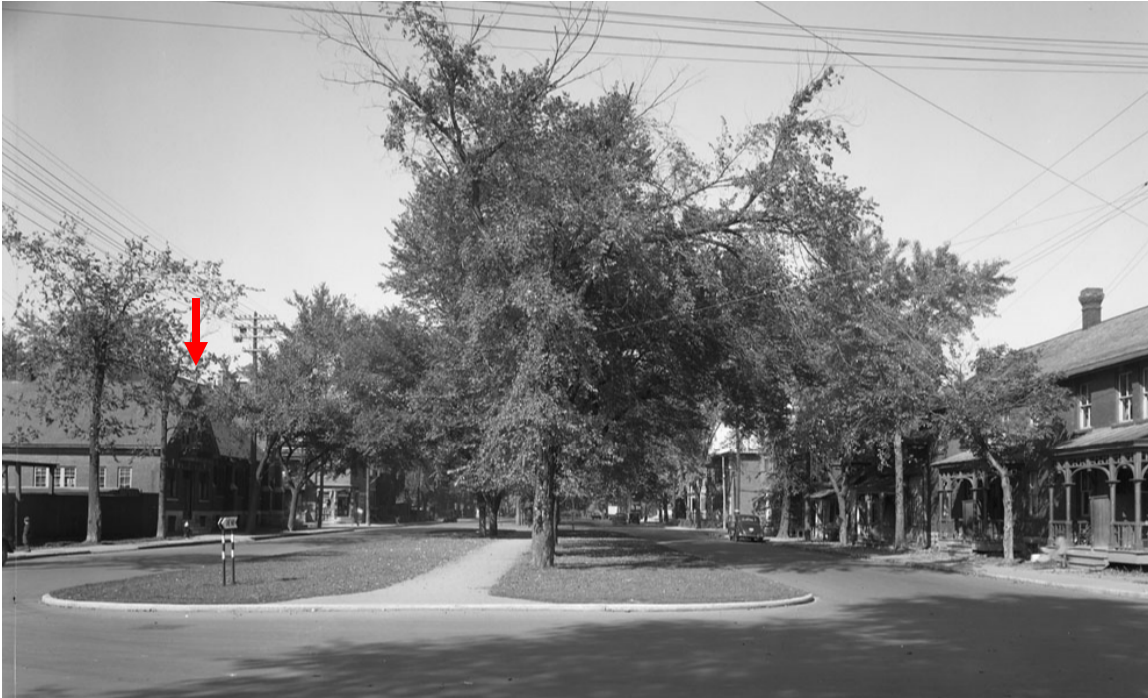
King Edward Avenue at York Street looking north.

Edward Avenue today divides Lowertown into East and West sectors. However, in 1920, when this church was completed, King Edward Avenue was a tree-lined thoroughfare with a boulevard running through the heart of the Lowertown neighbourhood.