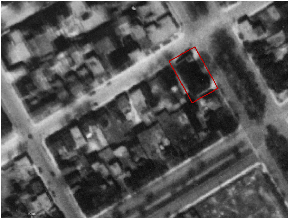
Aerial Photo, Source: GeoOttawa, 1928

The Église évangélique baptiste d'Ottawa is located on the eastern edge of present-day Lowertown West, at the intersection of King Edward Avenue and Clarence Street. King