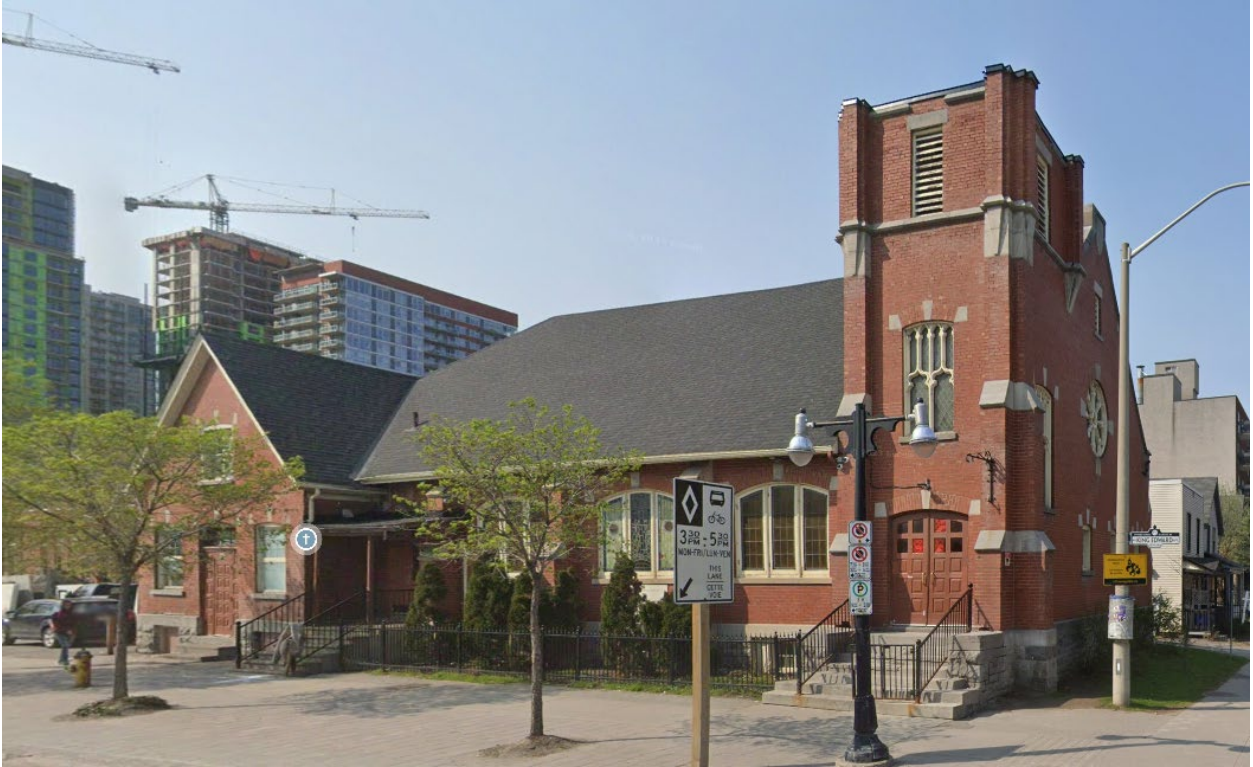
Église évangélique baptiste d'Ottawa, King Edward Avenue at Clarence Street.