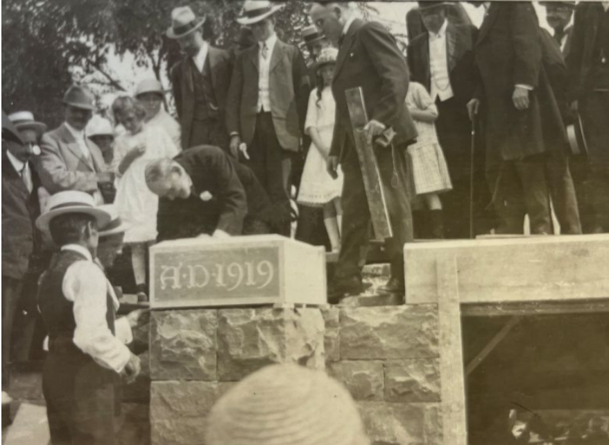
Corner stone ceremony, July 1, 1919.

The north façade features a parapet containing a small crest with the Latin words Fiat Lux , meaning “ Let there be light. ”, the motto for the Grande Ligne Mission. 2 The north wall also features a central rose window with a bible in the centre, segmental arched windows with stone and keystones and brick voussoirs. There is a tall rectangular window with leaded glass and tracery in the corner tower. The church features two memorial windows for former congregation members fallen during the First World War. 3