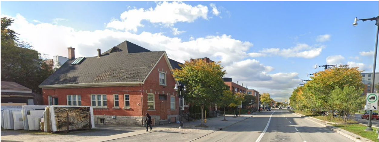
King Edward Avenue looking north at York Street.