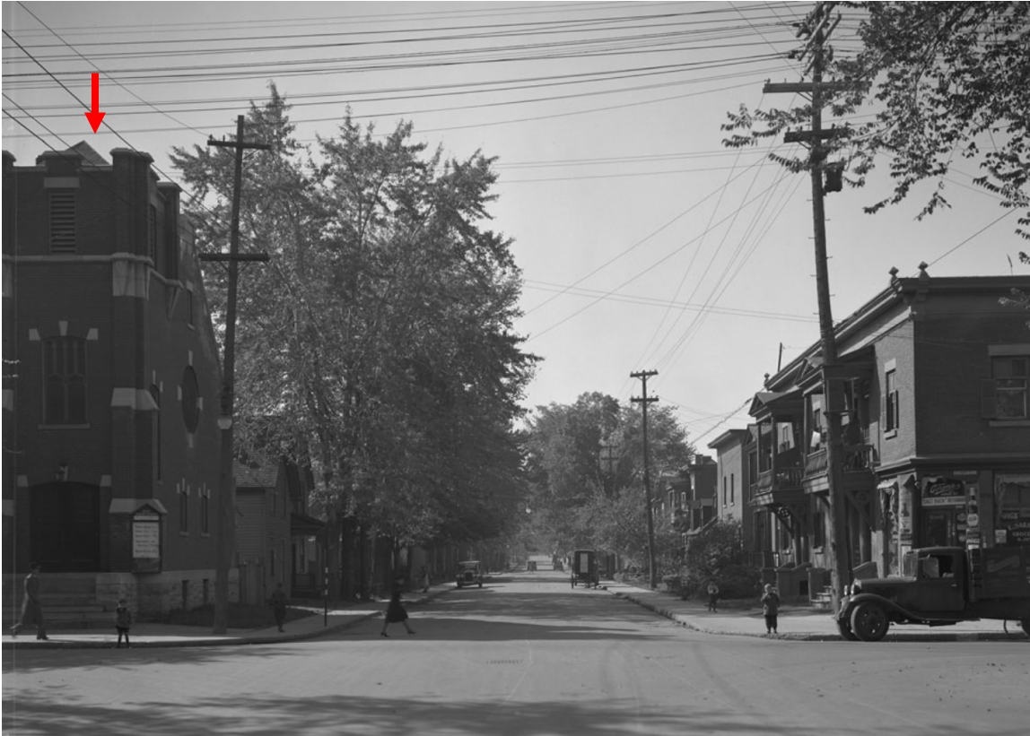
Clarence Street at King Edward looking west.

maintaining the historic character of Lowertown and its eclectic mix of buildings from several eras. The red brick building has been a dominant feature along King Edward Avenue for a century. Its age, style and construction materials maintain the historic character of Lowertown.