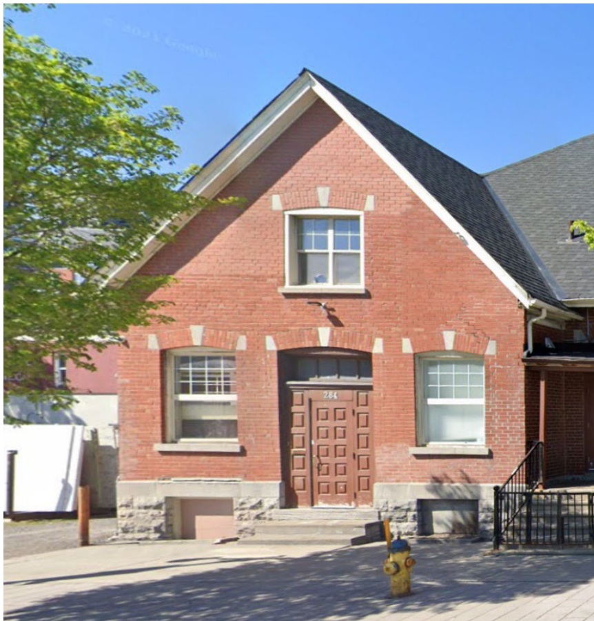
Left: Gospel Hall.

The south end of the building contains the former Gospel Hall, a simple gable-roof structure with a row of rectangular windows. The Gospel Hall was erected in 1904 to house the growing Baptist congregation. Originally located at the corner of King Edward