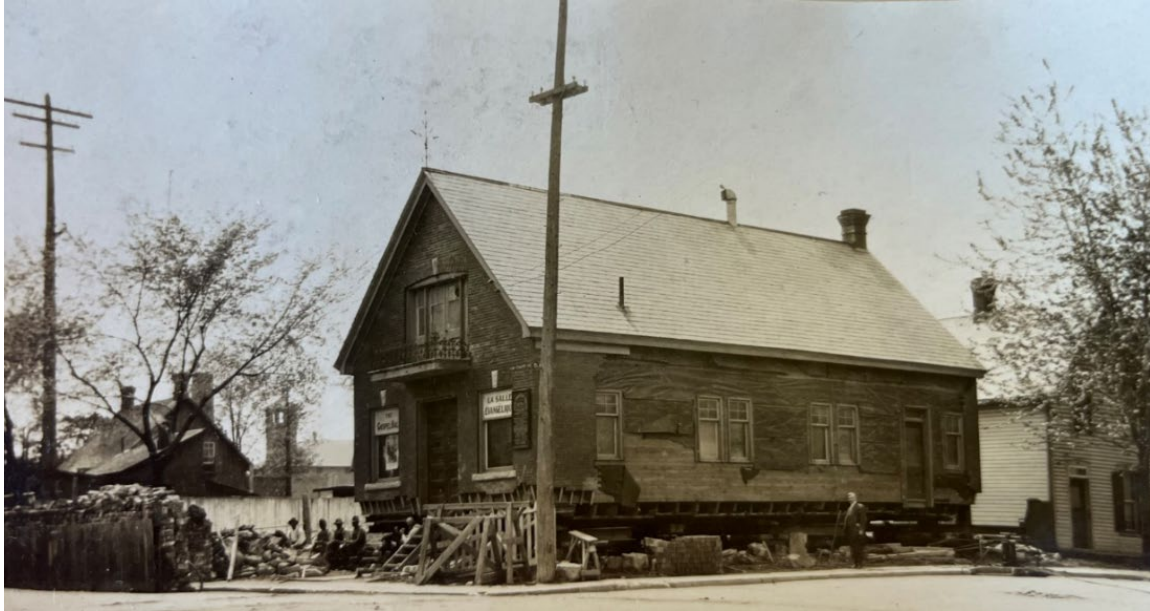
Église évangélique baptiste d'Ottawa, relocation of the Gospel Hall, 19-19-1920.

Avenue and Clarence Street, it was moved to its present location in 1919 by rolling it across the site, an uncommon practice for the time. The Gospel Hall would be incorporated into the new church, serving as the Sunday School. 4