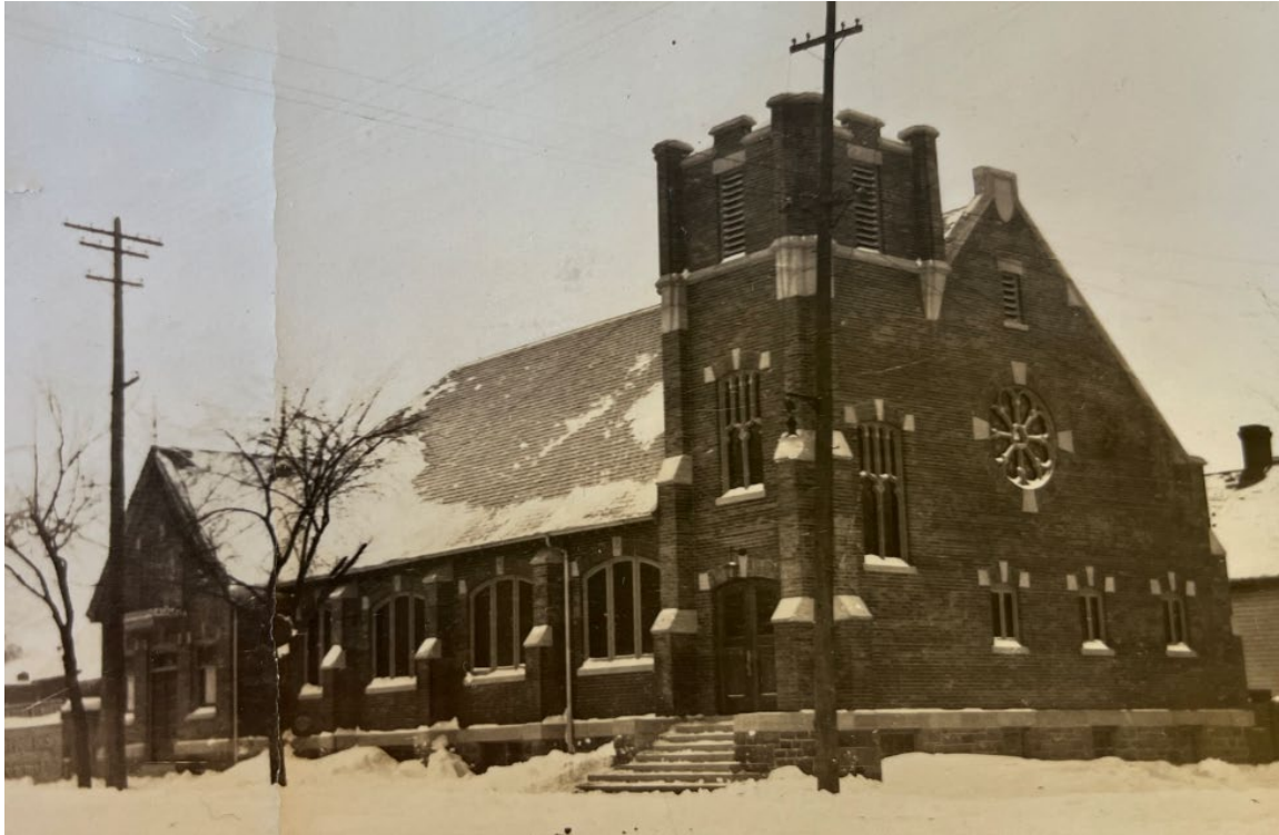
Église évangélique baptiste d'Ottawa.

The French Baptist Church, now known as the Église évangélique baptiste d'Ottawa was constructed in 1904 as a Gospel Hall, and later expanded between 1919 and 1920. The building is an example of the Late Gothic Revival Style. In the 19 th century, Late Gothic Revival churches were clearly derived from medieval examples, however, by the first decades of the 20 th century, architects chose to use elements of the Gothic style, such as pointed arch windows, buttresses and towers to embellish their churches and evoke the character of the more complex example of the 19 th century. The simplification of the design was part of a widespread movement away from the Revival styles of the 19 th century. 1