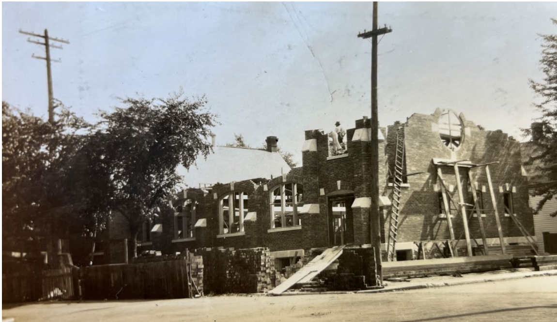
Église évangélique baptiste d'Ottawa under construction (1919-1920).

separated on the east and west façades by segmental arched windows with brick voussoirs and limestone keystones.