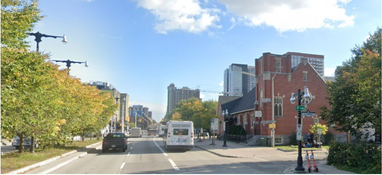
King Edward Avenue looking south at Clarence Street.