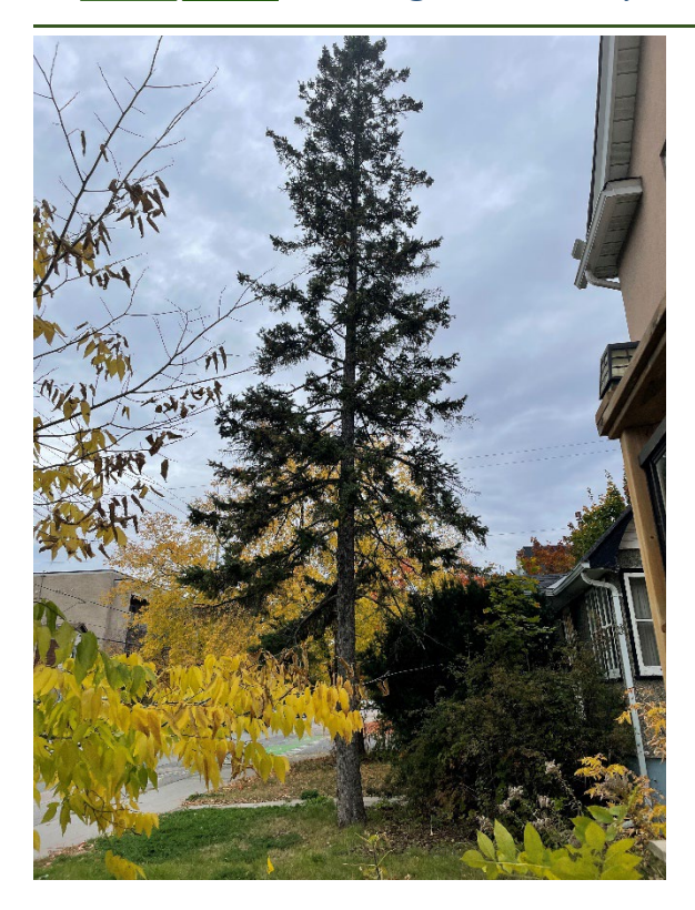
Figure 2: Tree 2, white on adjacent property

Dendron Forestry Services www.dendronforestry.ca 613.805.WOOD (9663) info@dendronforestry.ca