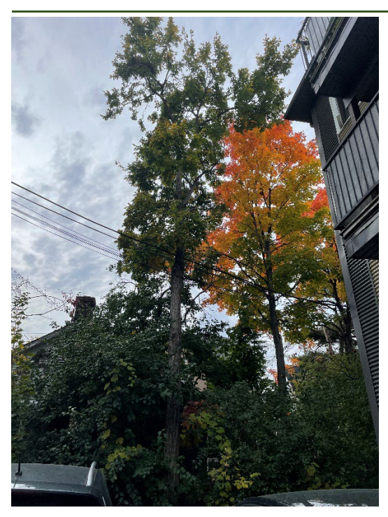
Figure 4: Trees 4 (sugar maple, right) and 5 (left, American elm) to be retained

Dendron Forestry Services www.dendronforestry.ca 613.805.WOOD (9663) info@dendronforestry.ca