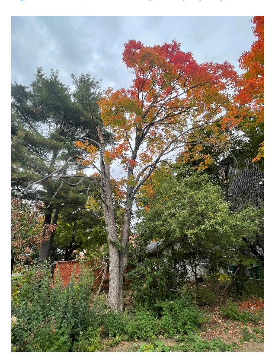
Figure 3: Tree 3, sugar maple on adjacent property to be removed