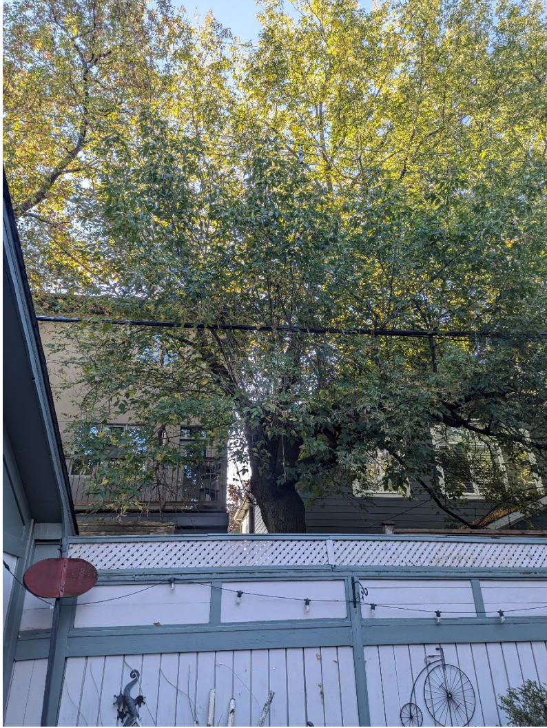
Tree 2 - adjacent Manitoba maple to be removed.