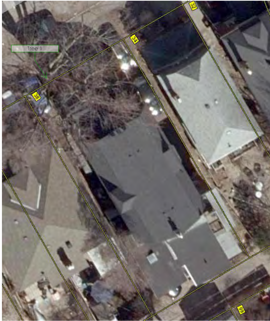
Tree Information Table