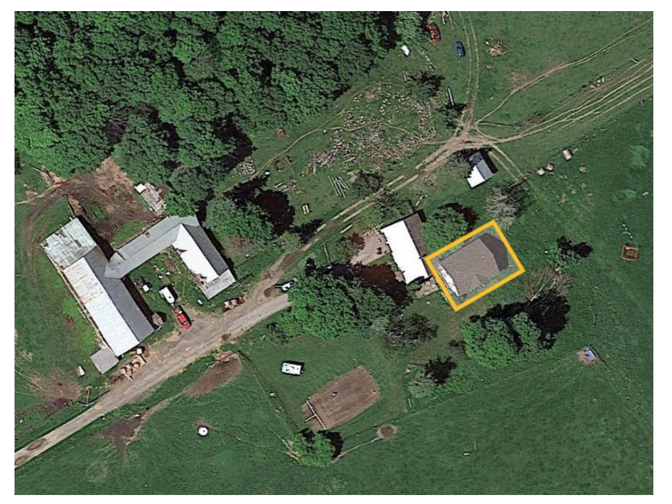
The subject property before the fire, with the location of the Presley House outlined. Source: Google Earth, June 2, 2018.