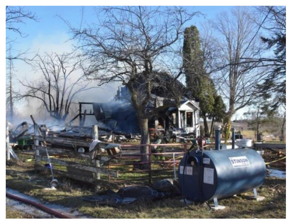
The property during the fire on December 12, 2021.