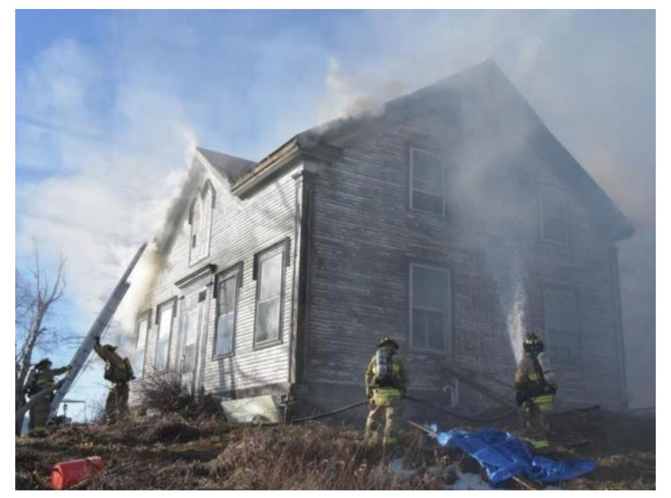
The property during the fire on December 21, 2021.