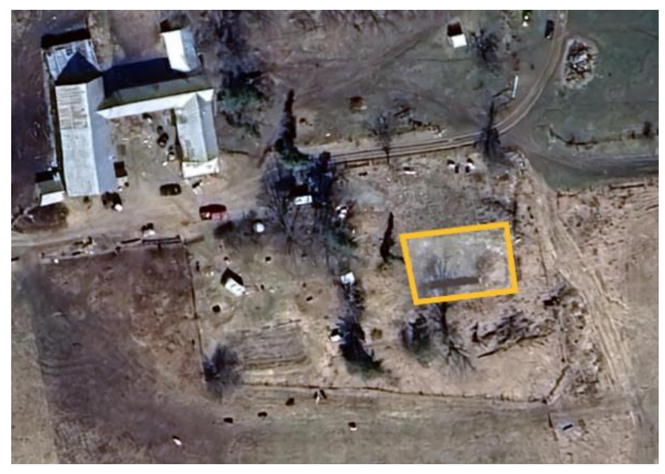
The subject property after the fire, with the location outlined where the Presley House stood before the fire.