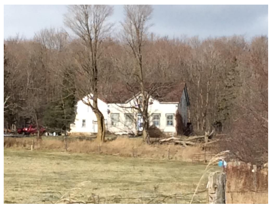
The subject property before the fire. Undated image.