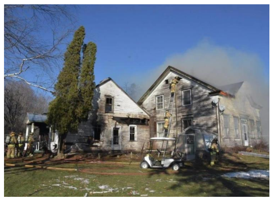
The property during the fire on December 12, 2021.