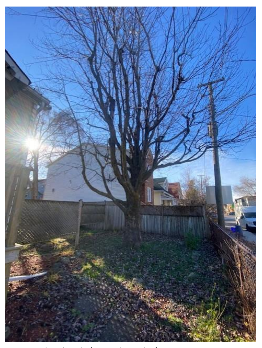
Tree #1 Red Maple in the front yard NW side of 120 Queen Mary St. To be removed and replaced.