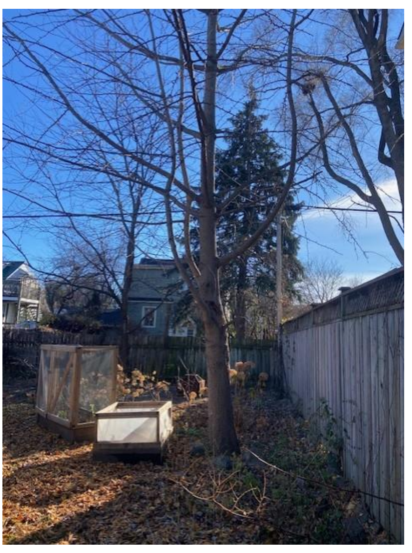
Tree #2 Gingko in the back yard SW side of 120 Queen Mary St. To be removed and replaced