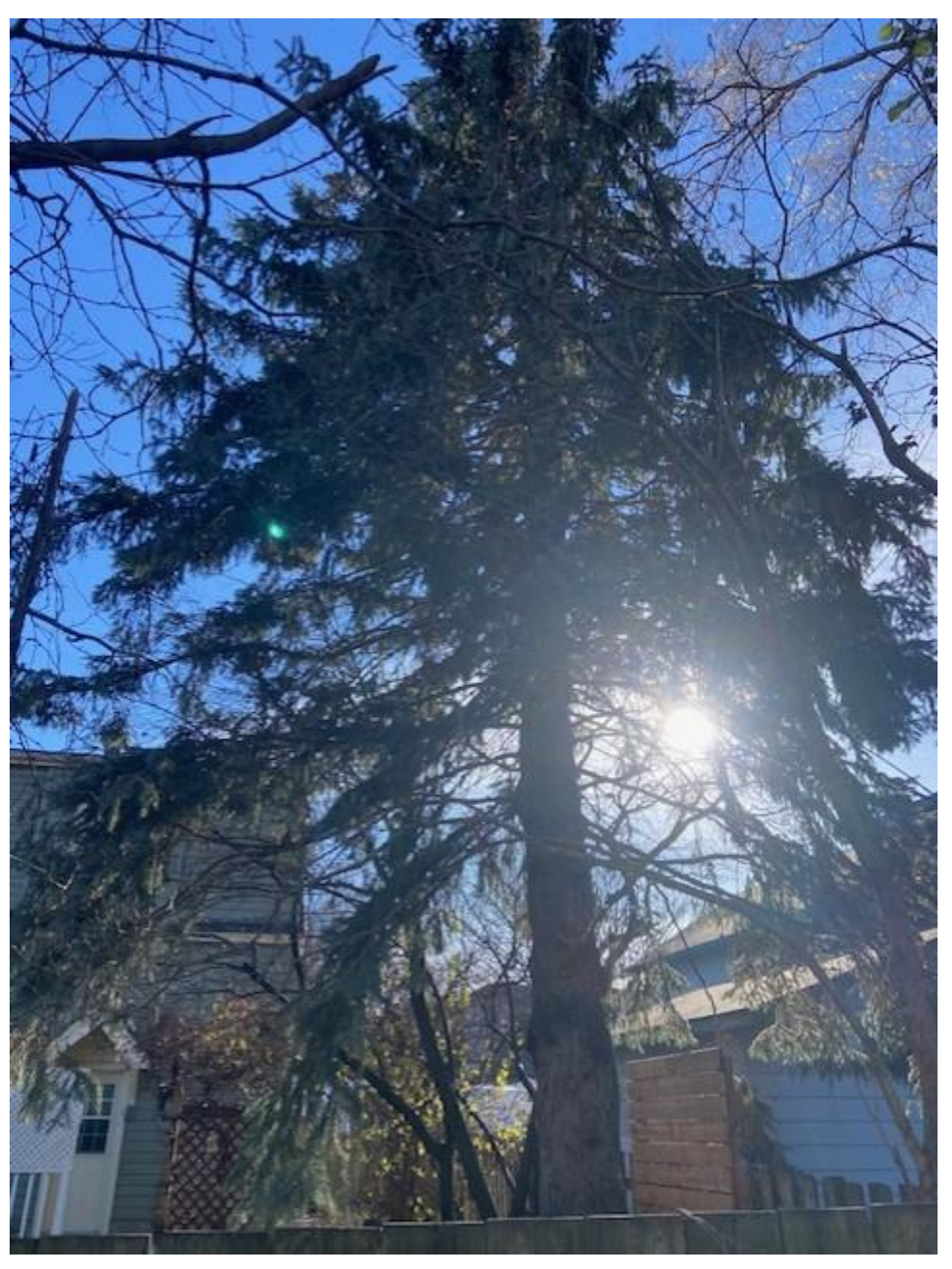
Tree #5, Blue Spruce in the neighbouring back yard to the South of 120 Queen Mary St. No action required