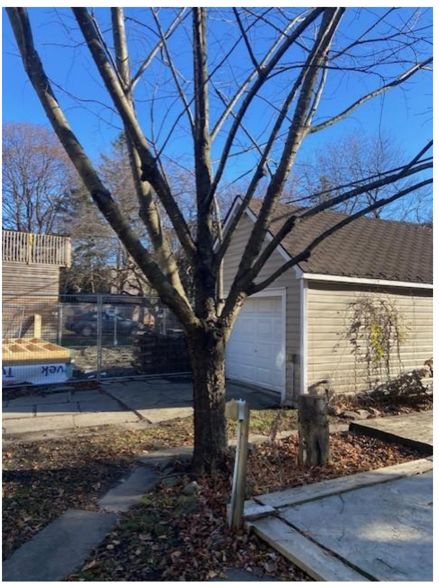
Tree #3, Yellow birch in the back yard SE side of 120 Queen Mary St. To be removed.