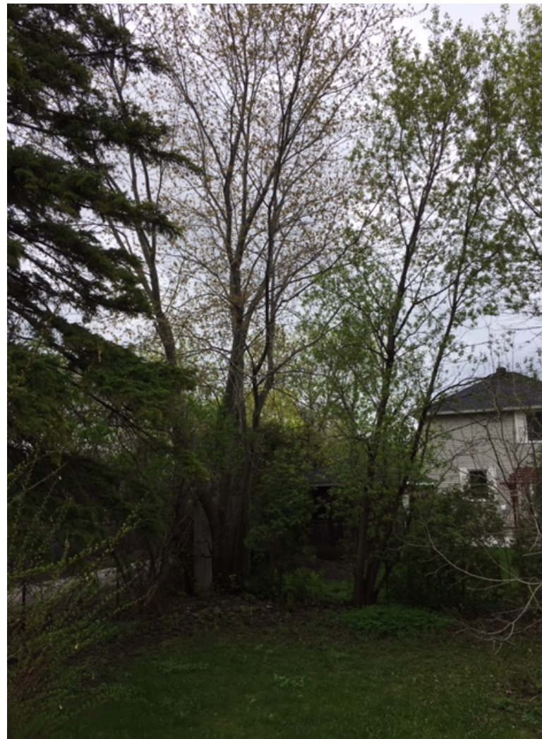
Neighbour silver maple(#3) To be protected

Any questions or concerns can directed to