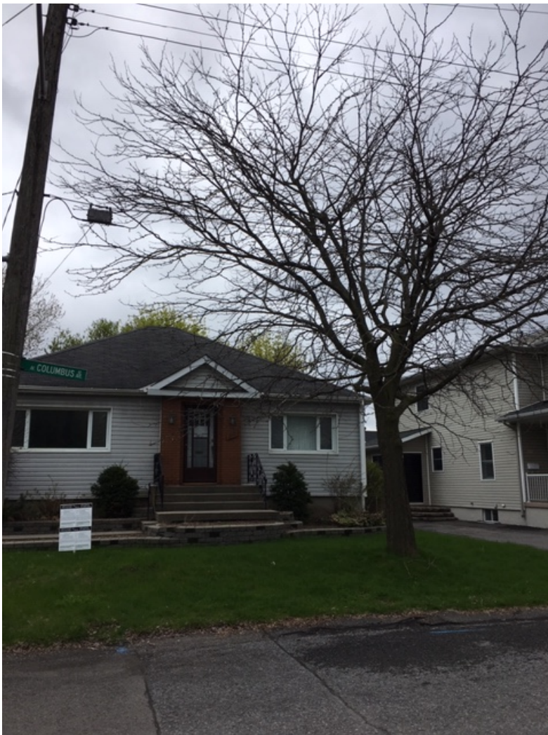
City owned Locust(#1) to be removed.