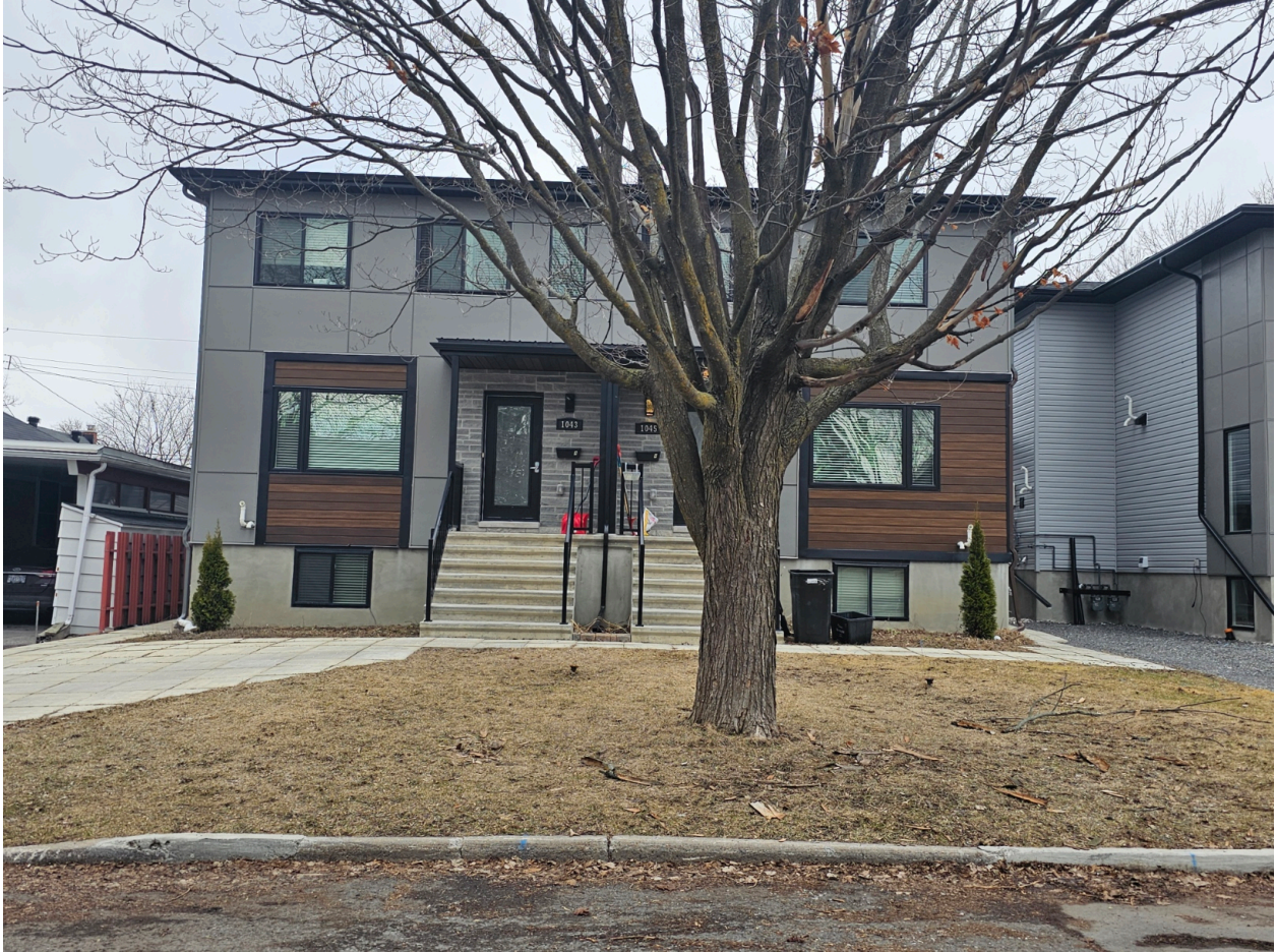
Figure 3- Recently Completed Semi-Detached Dwelling 1043/1045 Secord Avenue (R3A Zoning)