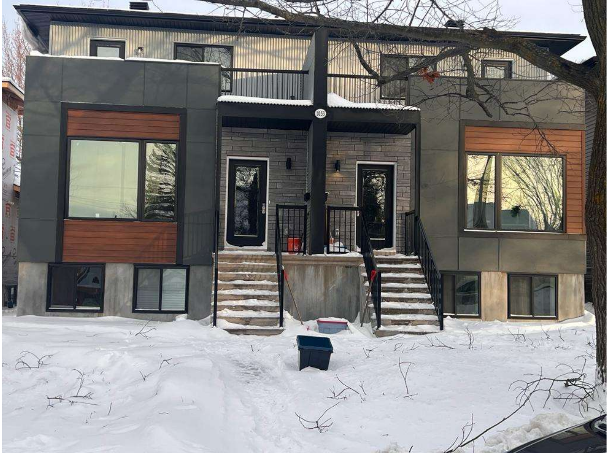
Figure 4- Recently Completed Semi-Detached Dwelling 1053 Secord Avenue (R3A Zoning)