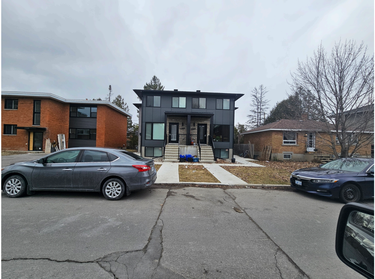
Figure 2- Recently Completed Semi-Detached Dwelling 2430/2432 Clover Street (R3A Zoning)