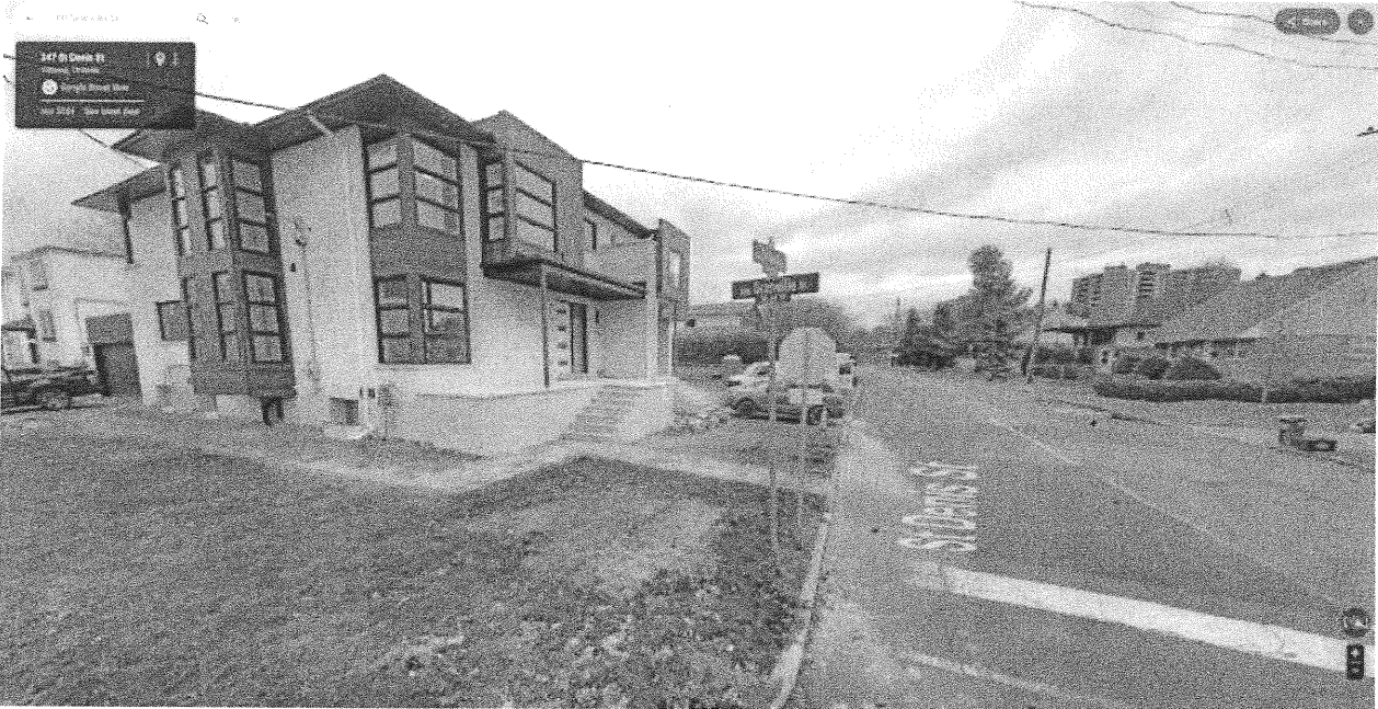
Figure 1: 351-353 St. Denis, as at November 2024

To speed up our application process and cost saving we are accepting to register this condition on both properties' titles.