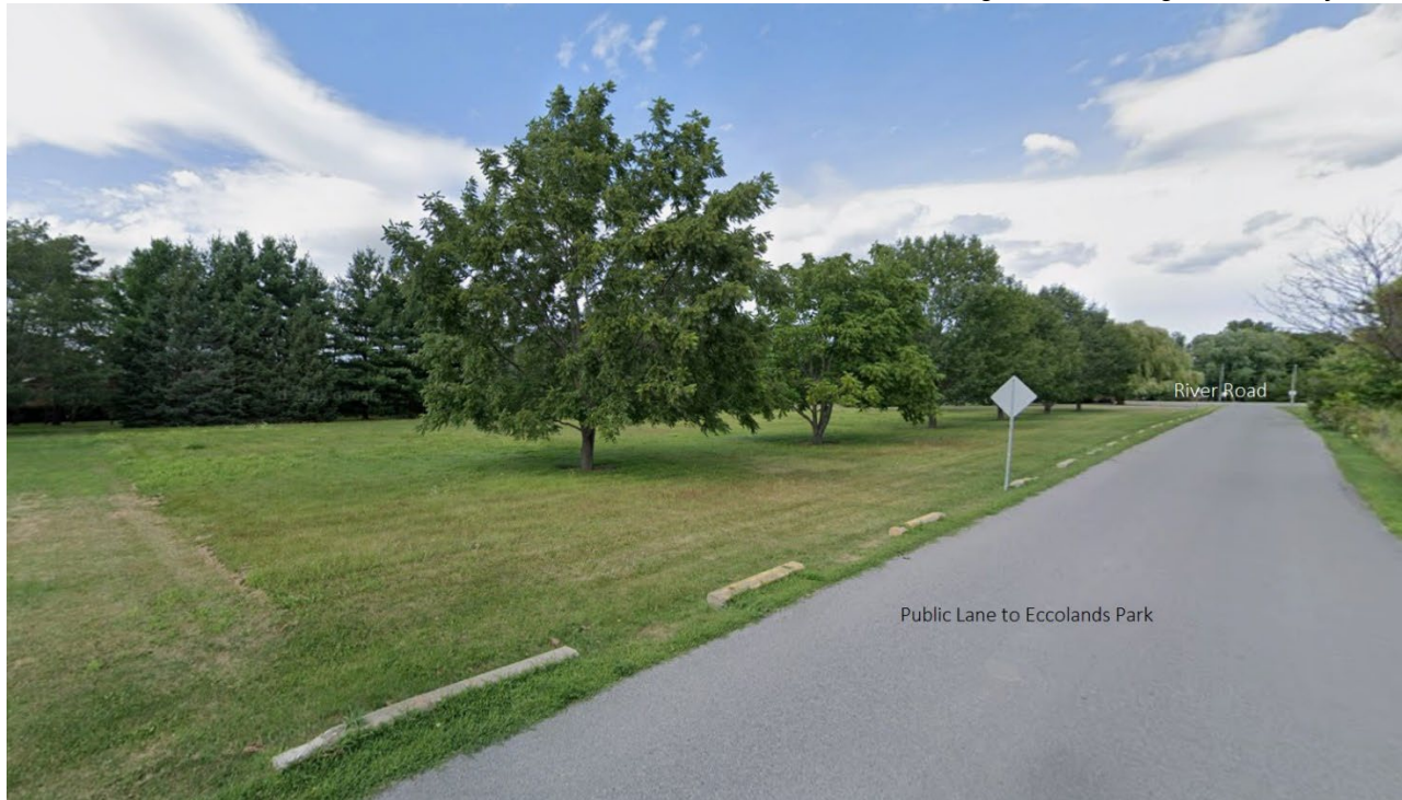
Figure 2: Existing Vacant Subject Property