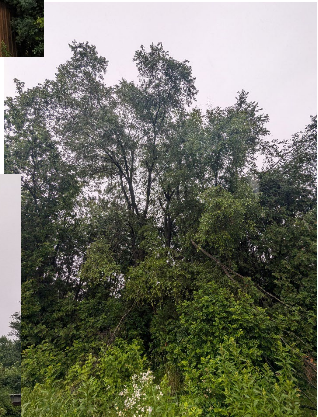
Right: Canopy of Tree 6 – adjacent elm to be retained.