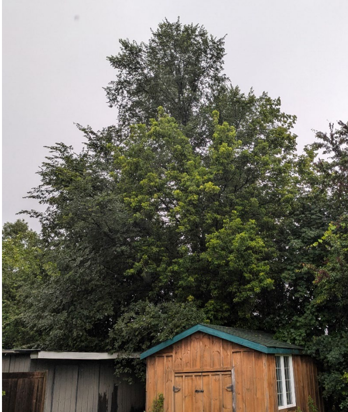
Above: Canopy of Tree 5 – adjacent elm to be retained.