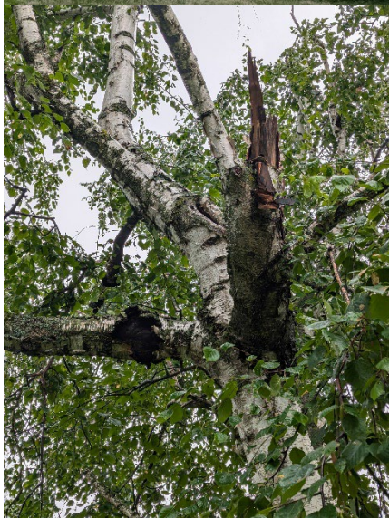
Above: Tree 2 - private birch to be removed.