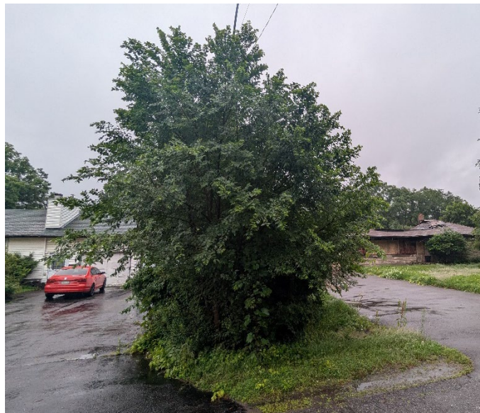
Below: Tree 1 - City poplar to be retained.