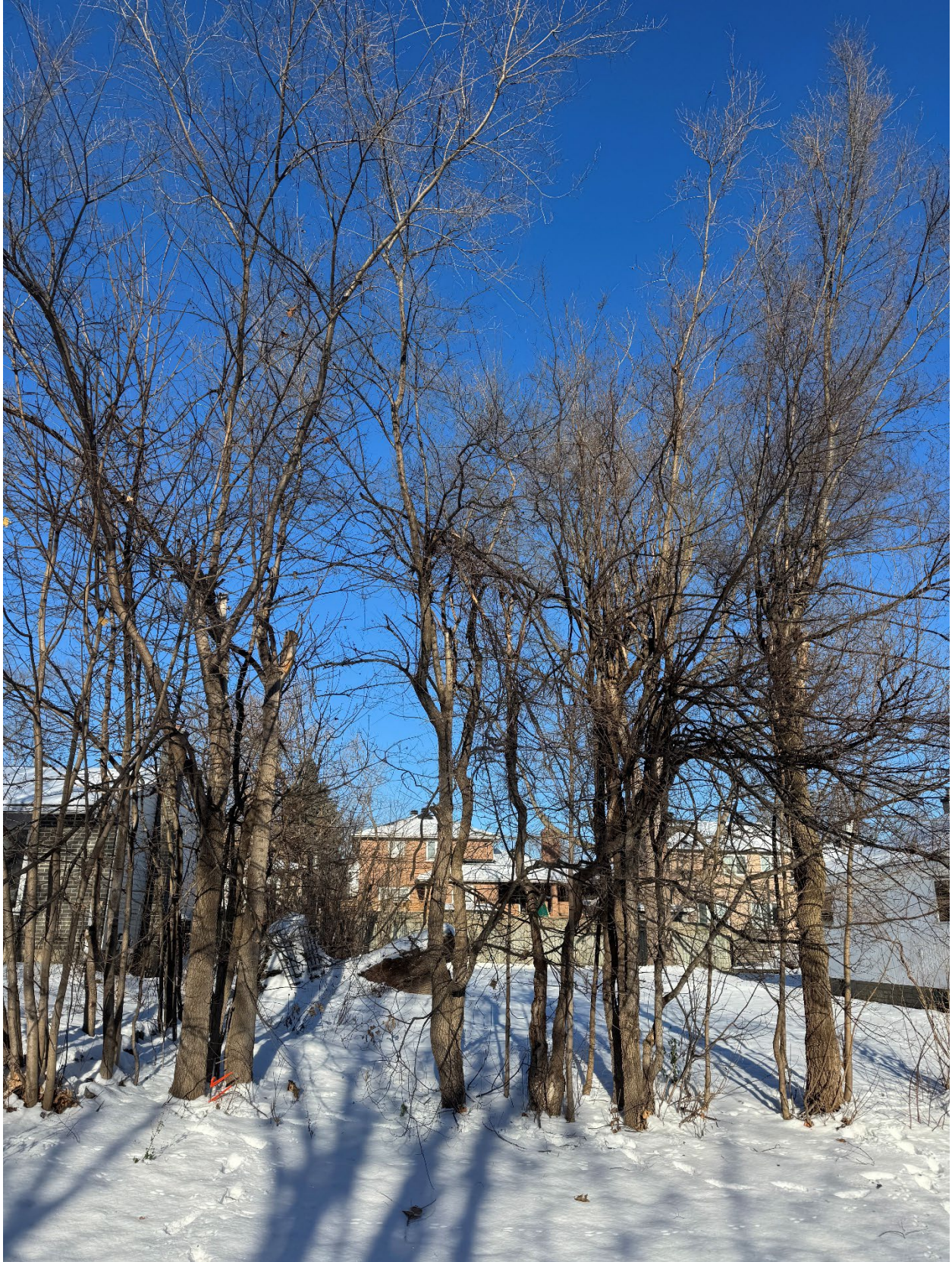
Figure 3: From right to left, trees 13-18, Siberian elm and Norway maple