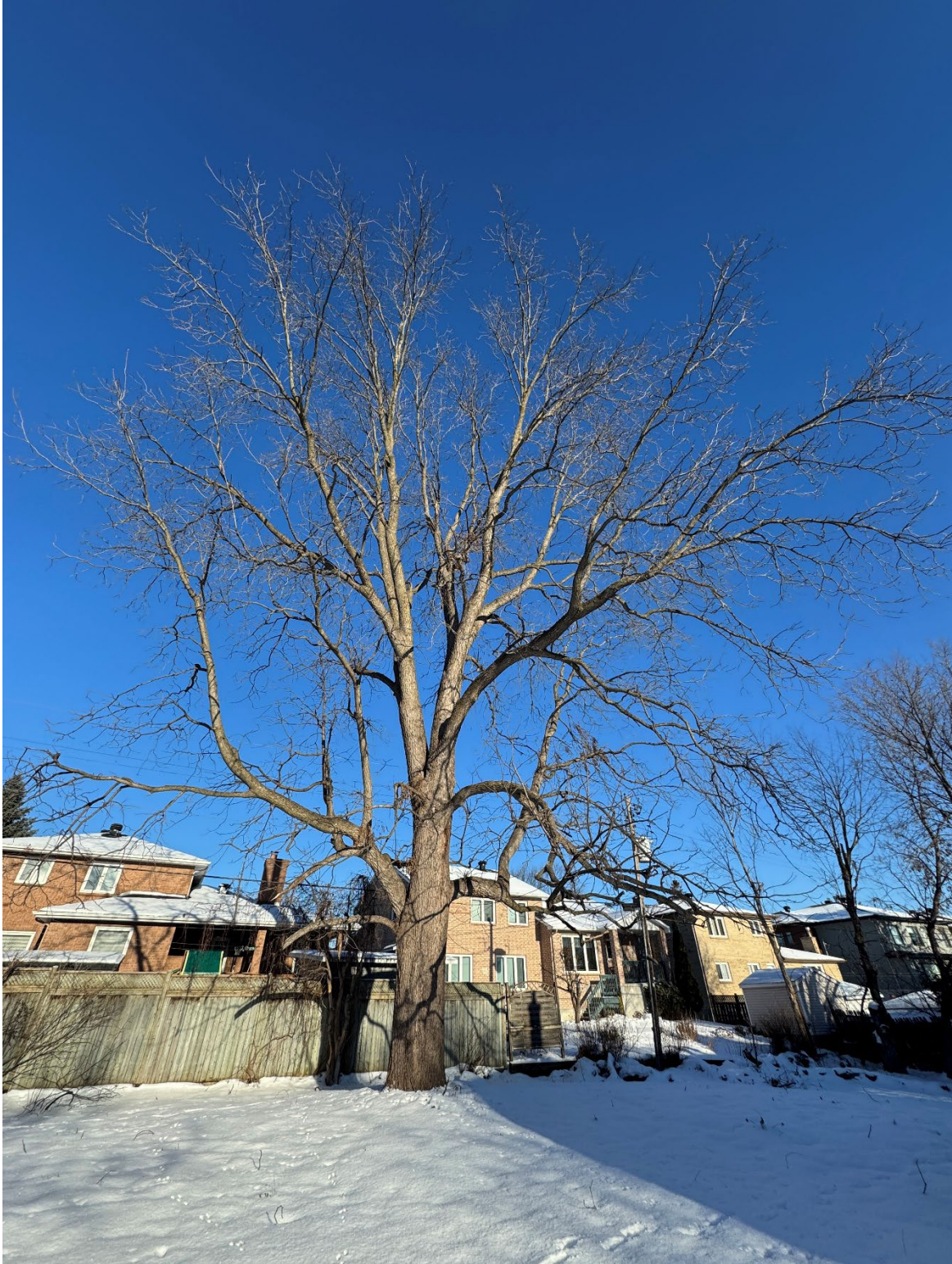
Figure 1: tree 1, large black walnut to be retained