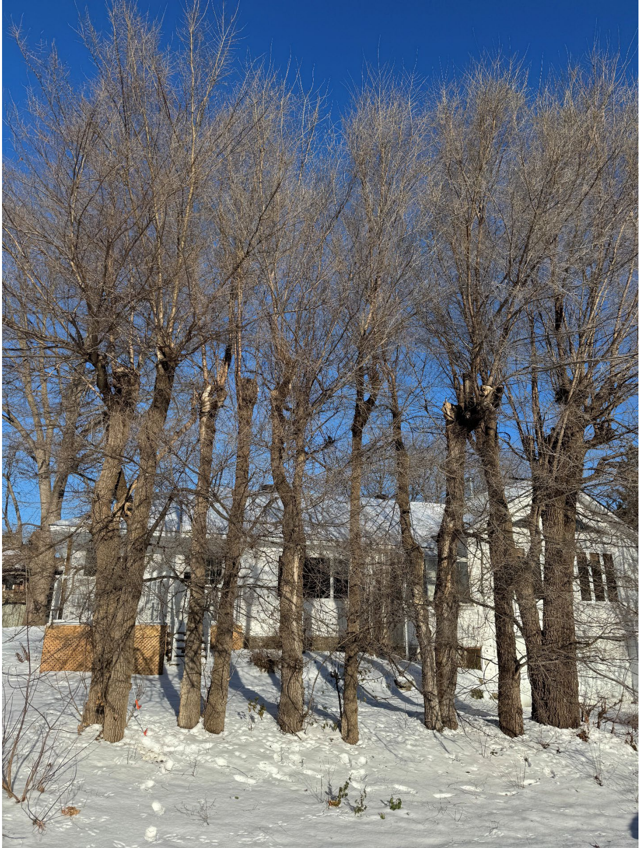
Figure 2: Trees 6-12, Siberian elm in fair-poor health, previously topped