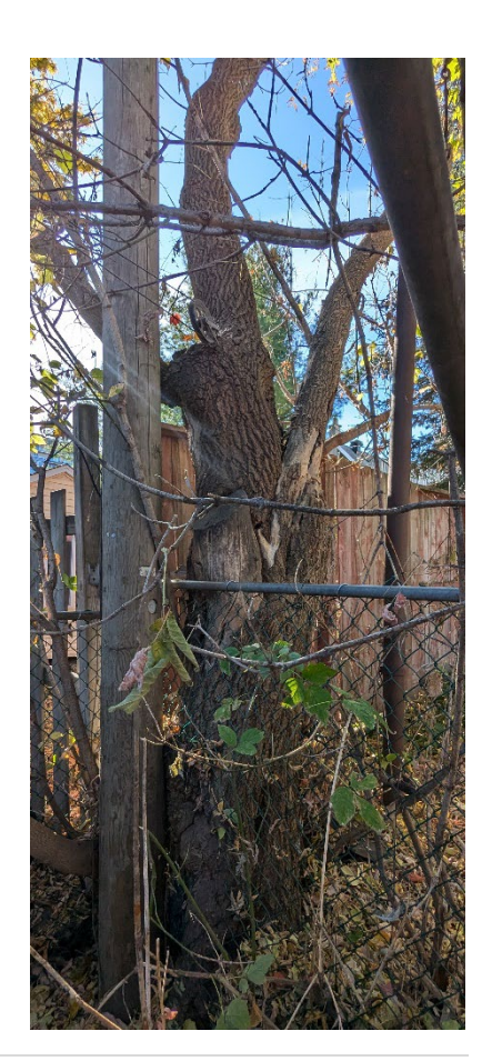
Tree 2 - boundary maple to be removed.