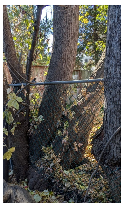
Base of Tree 4 - private maple to be removed.