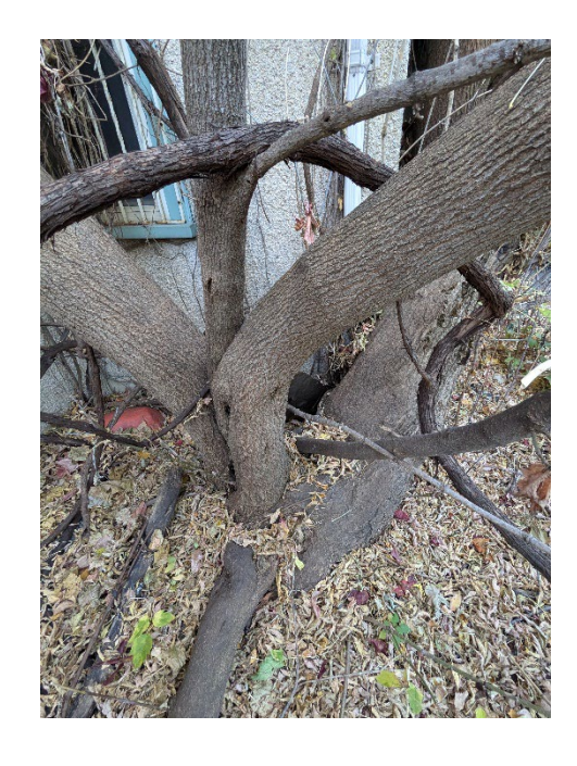
Clockwise from above left: Tree 1 - City maple to be retained.