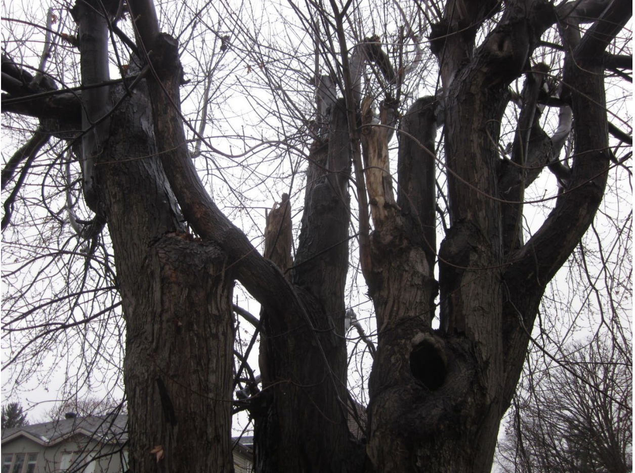
Picture 2. Deadwood, cavities and decay within bole of tree #1, city silver maple at 196 Clare Street.