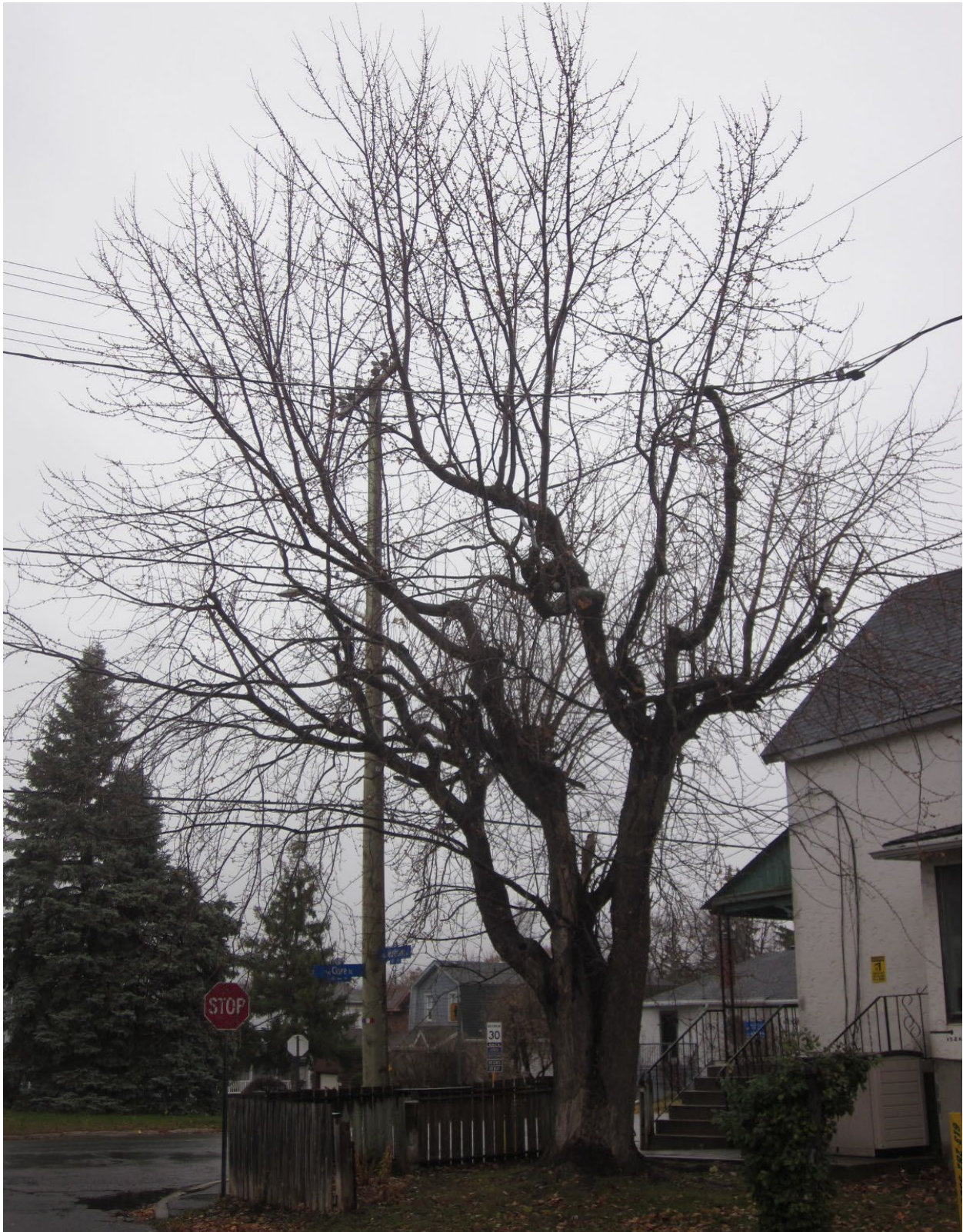
Picture 1. Tree #1, city silver maple at 196 Clare Street – tree to be removed.