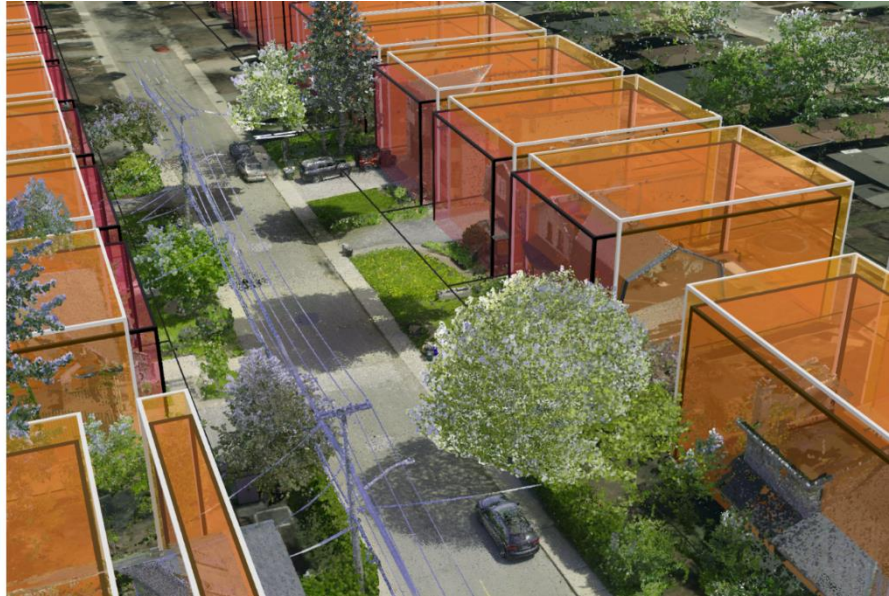
Figure - Comparison of existing and proposed zoning provisions for various N zones being shown by red and orange blocks.

The City's Digital Twin was used to model maximum building height and height transition provisions in three dimensions for N subzones using a mobile LiDAR scanner. The following are visual representation examples only.