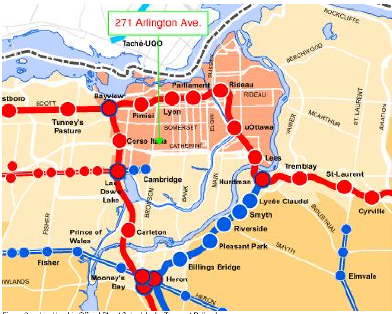
Figure 2: subject land in Official Plan / Schedule A - Transect Policy Areas

Email: <a href="mailto:chang.sun@bingro.ca">chang.sun@bingro.ca</a> Website: <a href="mailto:www.bingpro.ca">www.bingpro.ca</a>