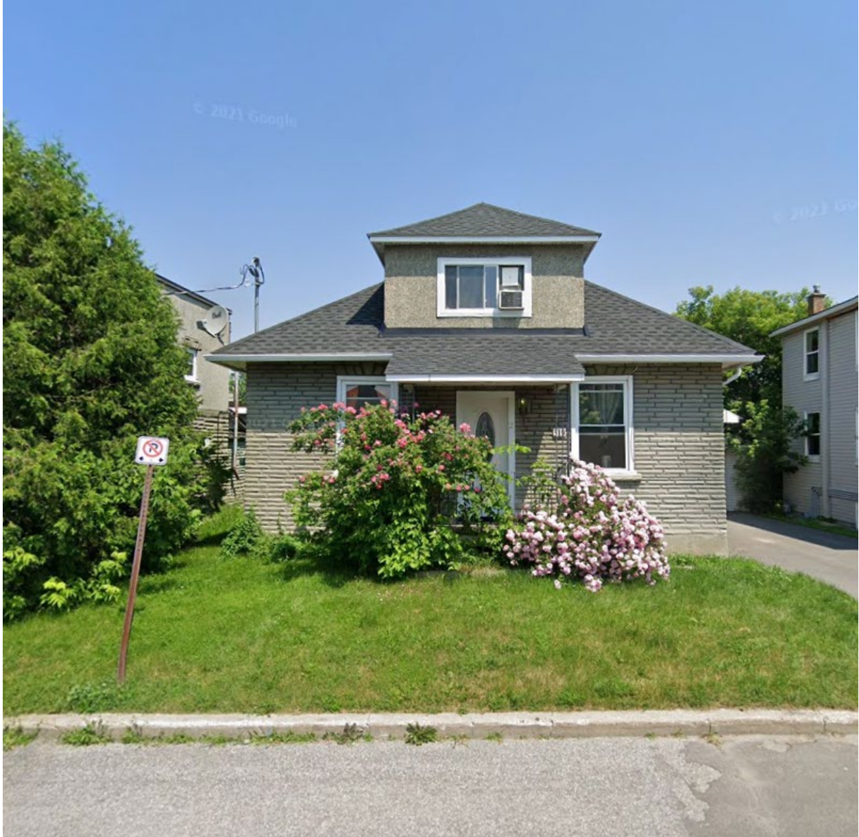
Figure 3, below, shows existing 1.5 storey dwelling at 319 Shakespeare today.