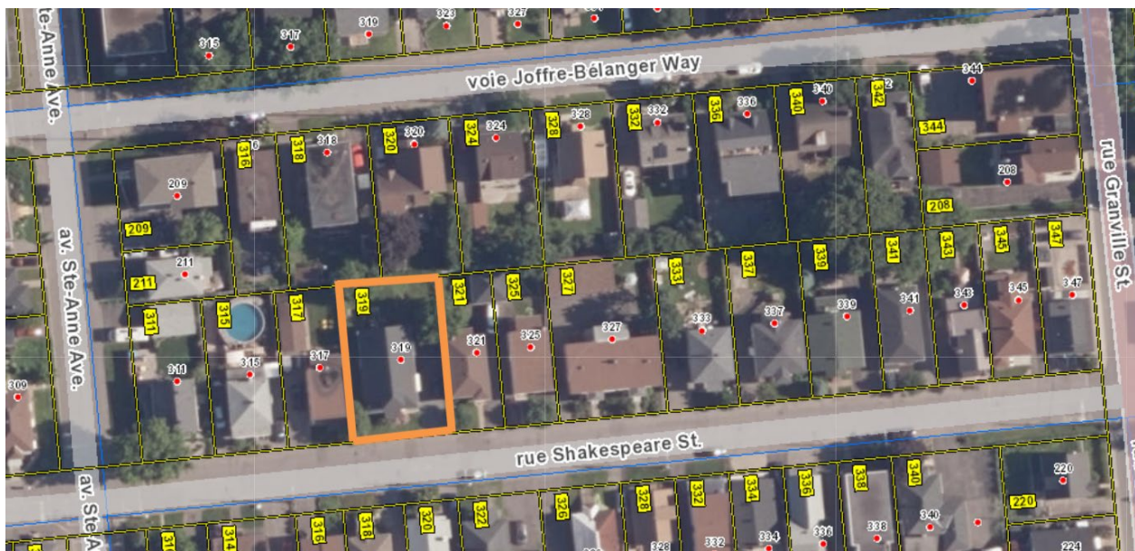
Figure 1 – Aerial view of the subject property, 319 Shakespeare Street

Figure 1 shows an aerial view of the subject property outlined in Orange. As shown in the aerial image, the surrounding land uses are predominantly residential.