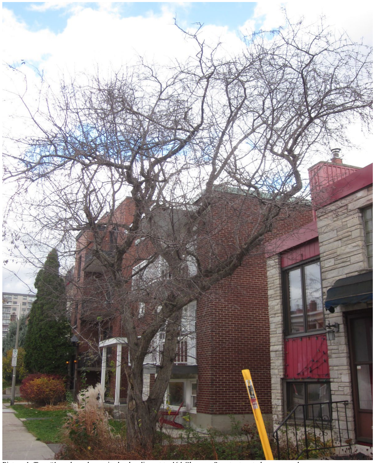
Picture 1. Tree #1, crab apple on city lands adjacent to 464 Clarence Street – tree to be preserved.