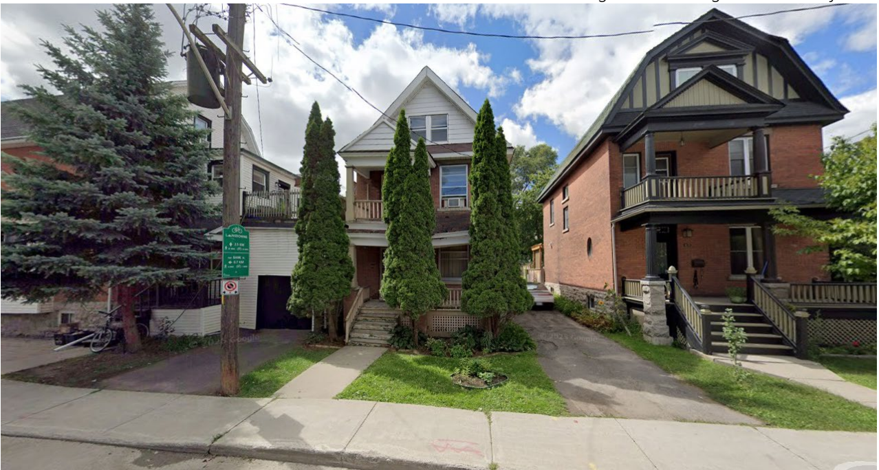
Figure 2: Existing home on Subject Property

This property falls within the Downtown Core Transect, under the Evolving Neighbourhood designation on Schedule A and Schedule B1 of the City of Ottawa's Official Plan.