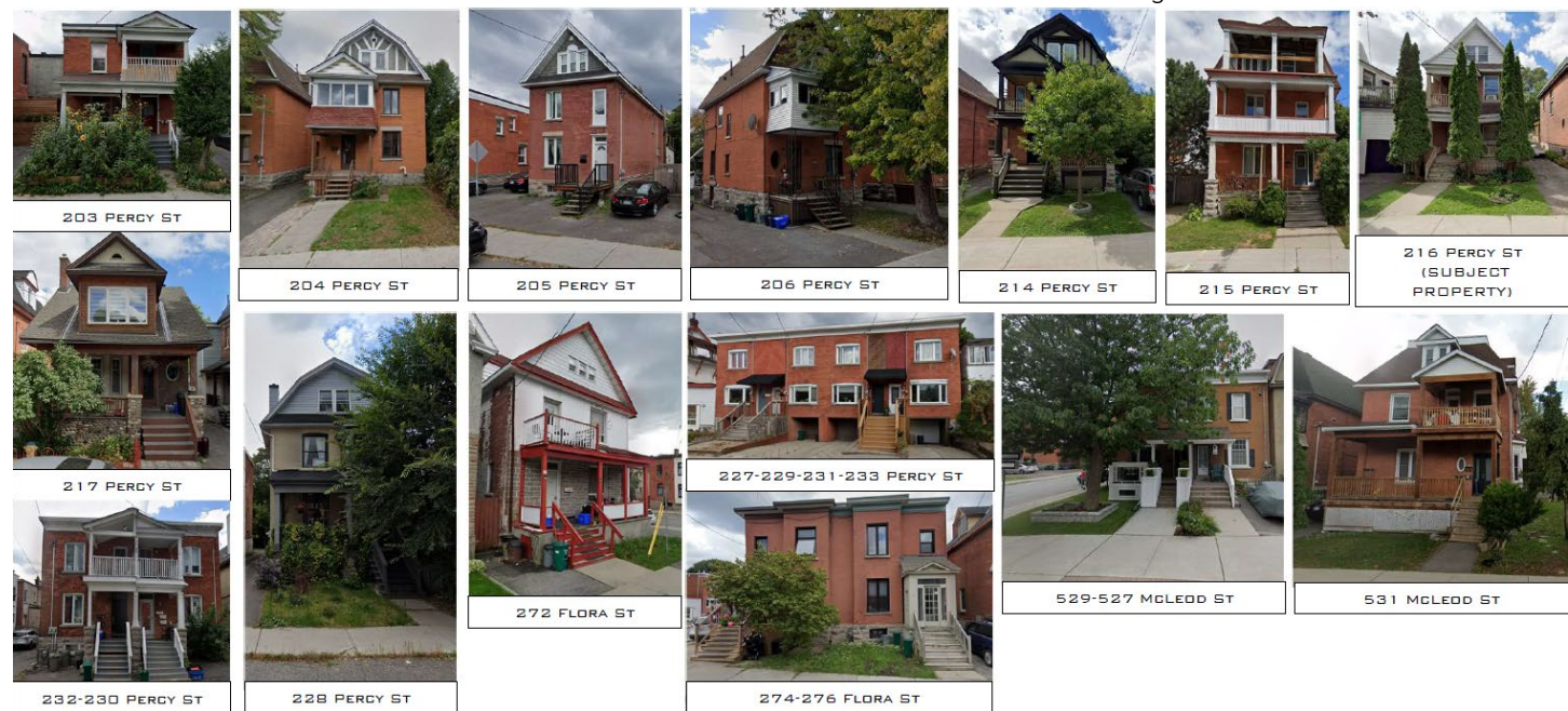
Figure 6: Front Entrance Character

While the steps could be turned to avoid this projection, we felt it was more in keeping with the established character of the neighbourhood for the front steps to extend out towards the street. This provides a more welcoming front entrance, and mirrors the front entrances of many other dwellings along this street. The assessment of whether a variance is minor hinges on whether it results in a minor change or causes any undue or adverse effects. In the case of the proposed front steps, it is evident that they enhance the development, and there is no negative impact.