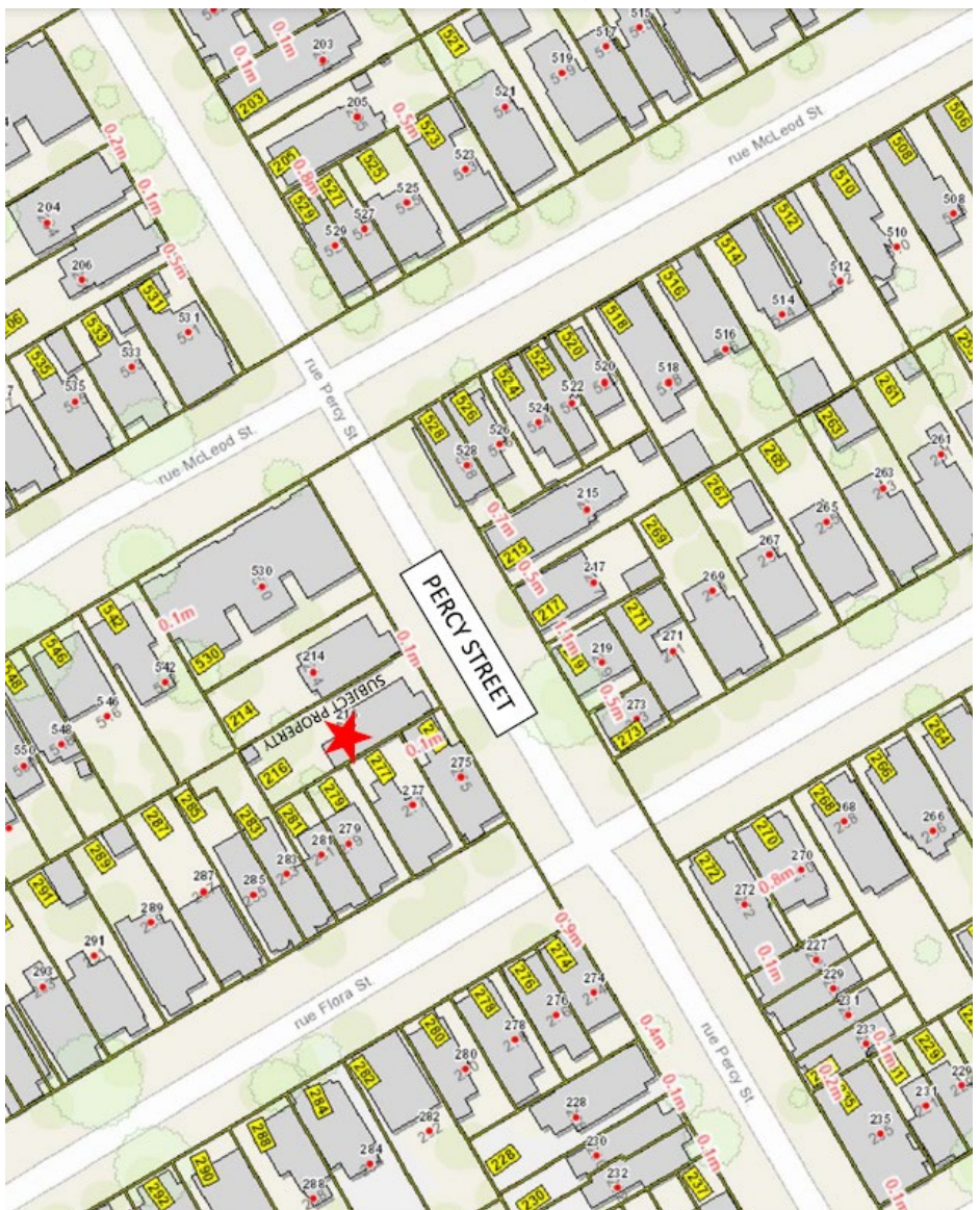
Figure 5: Small Side Yard Setbacks

The 1.2m side yard maintains enough spatial separation for windows to provide natural light between the buildings, and a secondary means of egress from the building. In our opinion this reduced rear yard setback does not cause any undue or adverse effects on the development or adjacent properties, and is in keeping with the established pattern of development in the neighbourhood.