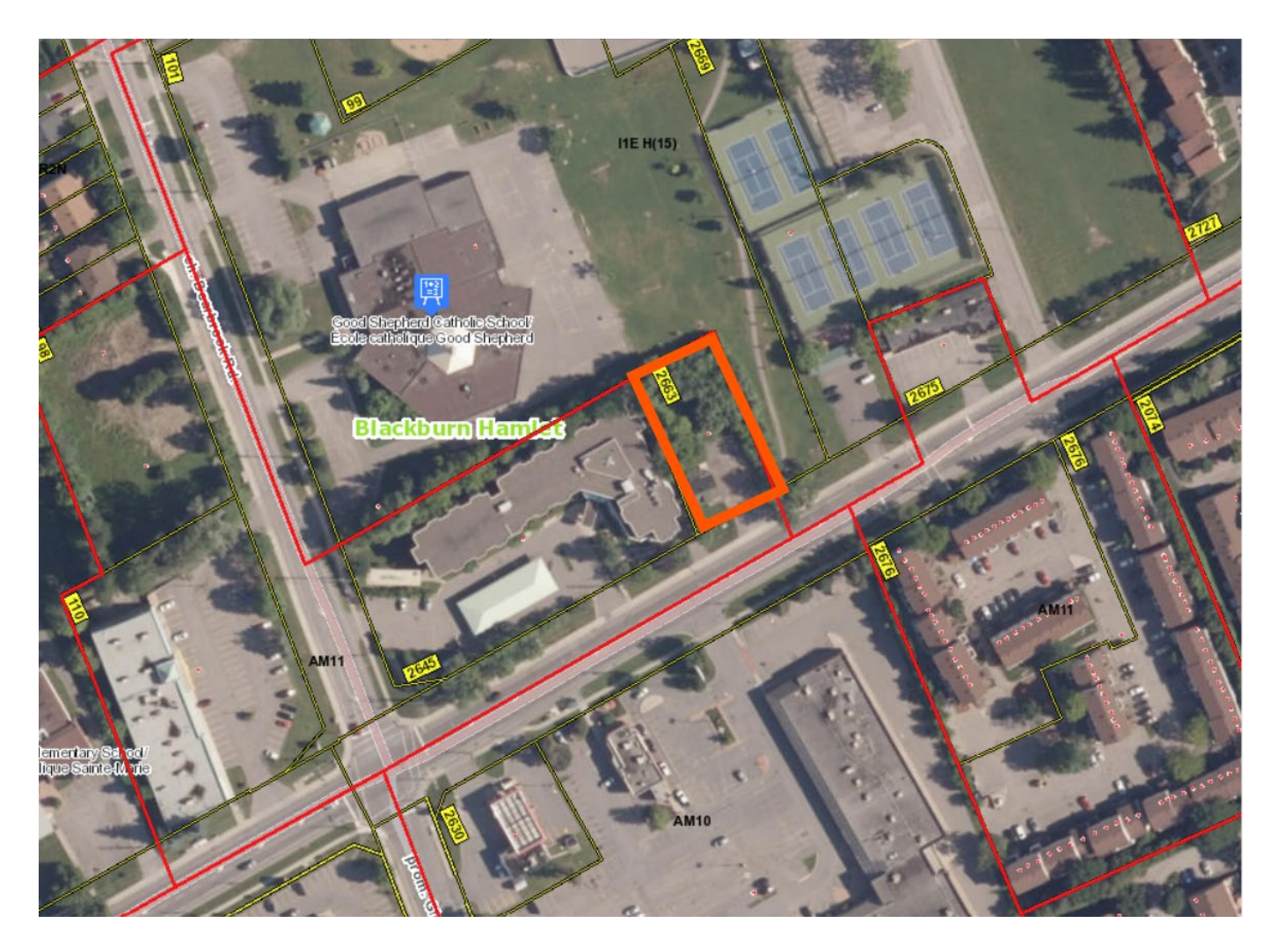
Figure 1 – Aerial View of Subject Property

As seen in Figure 1, the other surrounding land uses predominantly consist of a retirement home to the west of the site and a 20-metre pathway access to Good Shepard Catholic School. Across Innes Road is a shopping mall with a grocery store and to the east of the mall is a 3-storey tall townhouse complex.