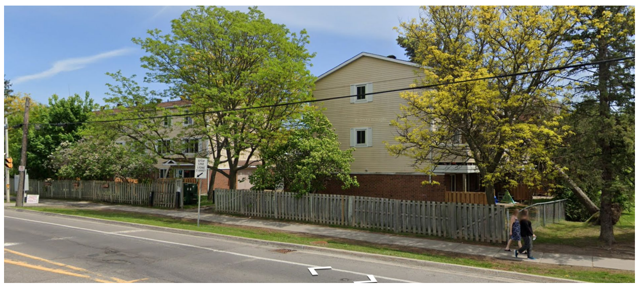
Figure 7 – Town house project next to the Shopping Mall abutting the subject property