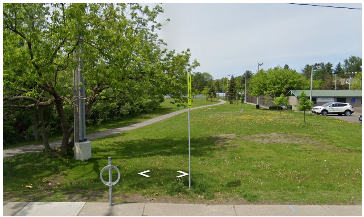
Figure 6 – Public Access to school grounds directly to the east of the subject property