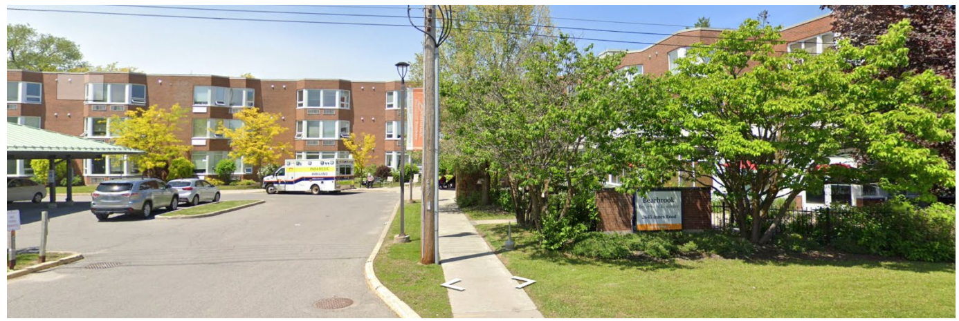
Figure 5 – Bearbrook Retirement Residence directly to the west of the subject property