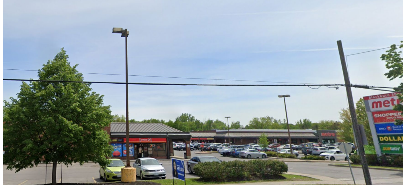
Figure 4 – View looking directly across Innes Road from the subject property