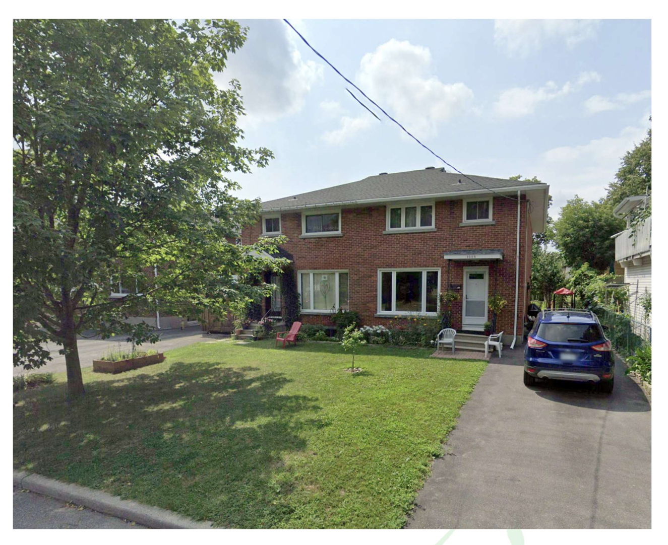
Figure 5 – Existing Duplex with Side Entrances at 1686 Grasmere Crescent