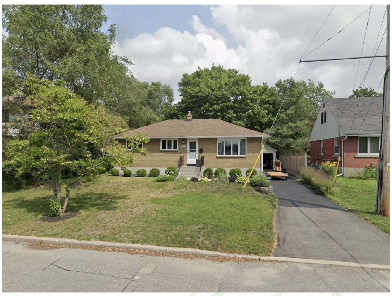
Figure 3 – Existing Dwelling at 1679 Grasmere Crescent

Figure 3, below, shows the existing house today at 1679 Grasmere Crescent. On Ridgemont Avenue there is currently a 4 Unit recently developed lot along with existing duplexes with side entrances at 1686 & 1720 Grasmere Crescent.