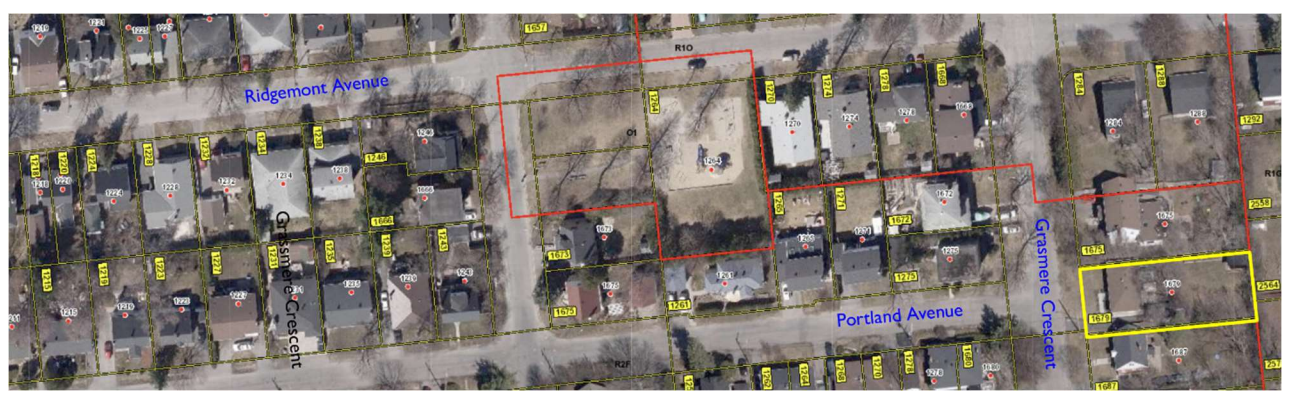
Figure 1: Aerial view of the subject property, 1679 Grasmere Crescent

The subject property is an interior rectangular lot located on Grasmere Crescent at the end of Portland Avenue. The lot is approximately 418 sqm and currently contains a one storey detached residential dwelling.