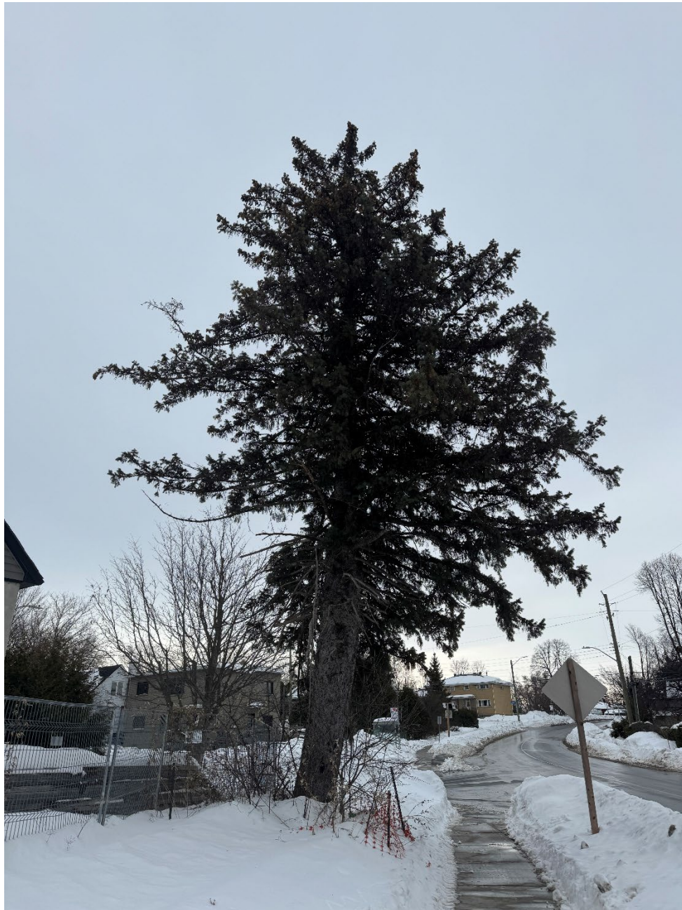
Figure 2: Tree 2, Colorado spruce to be retained