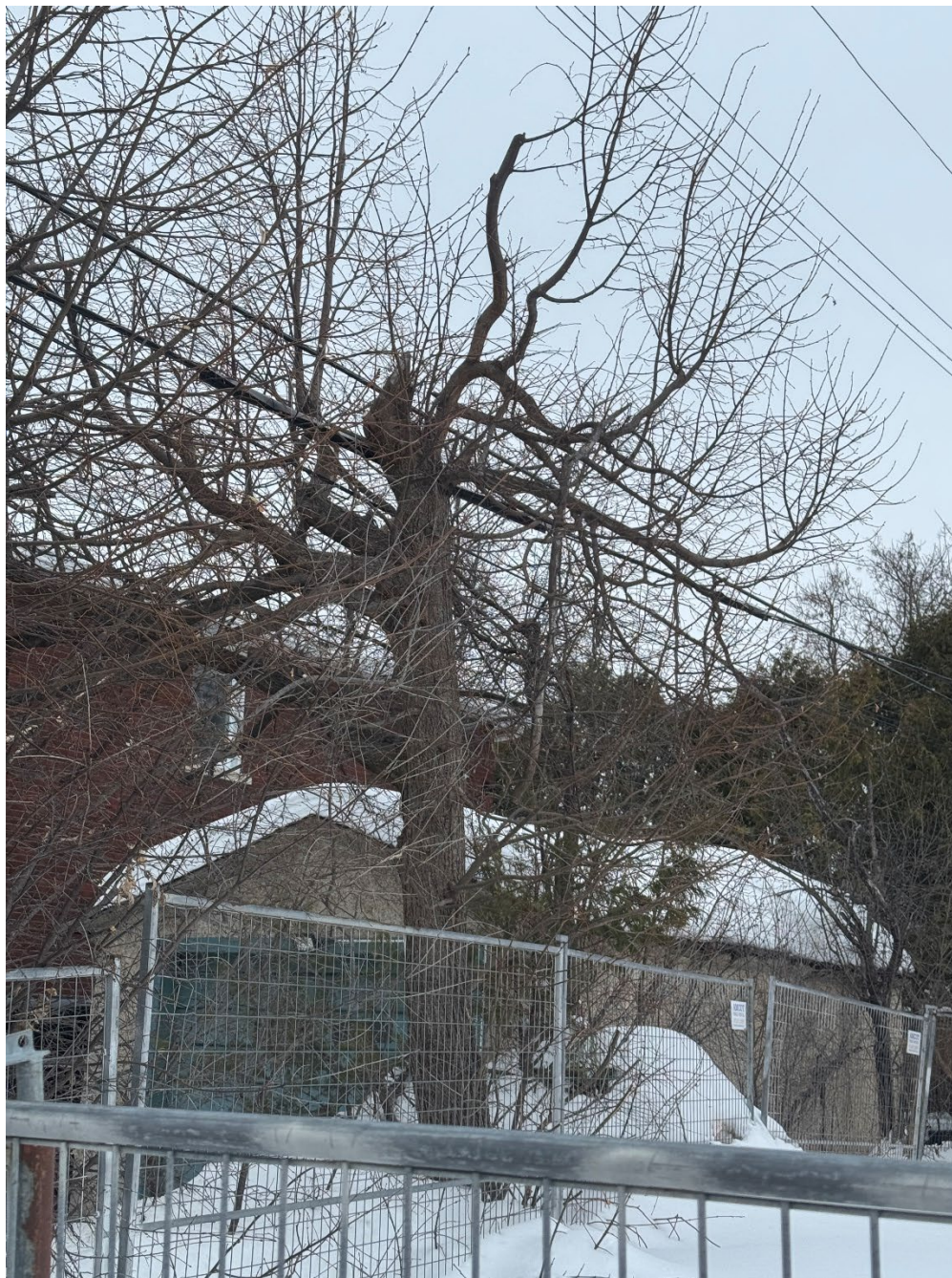
Figure 3: Tree 3, basswood on adjacent property to be retained