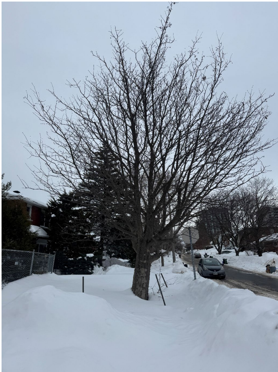
Figure 1: Tree 1, city-owned oakleaf mountain ash to be retained