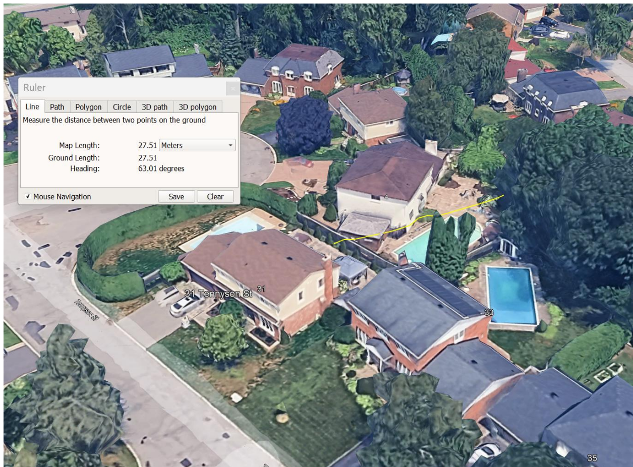
Google Earth distance measurement showing the nearest trees in the neighbouring yard with a measured distance of 27.51m to the back fence at 31 Tennyson street. Google Earth Imagry date 7/7/24.