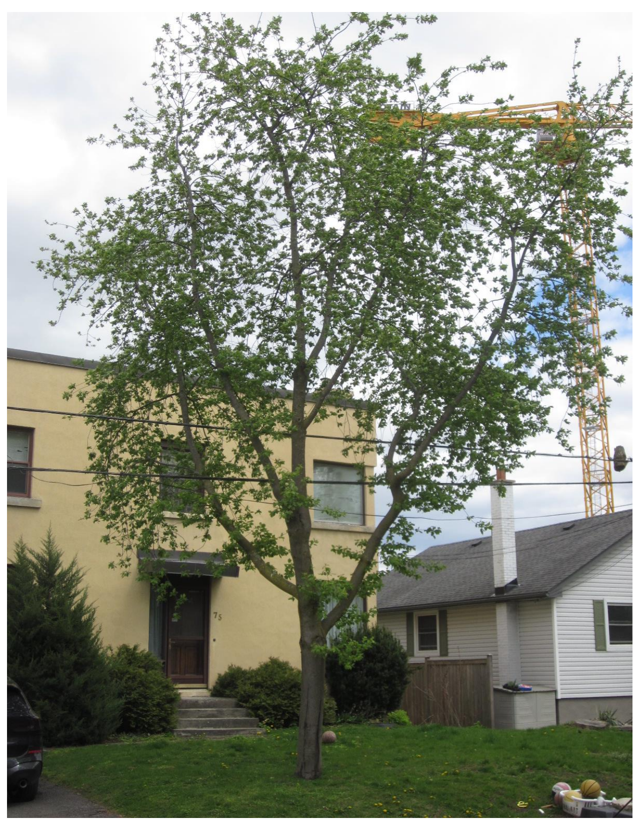
Picture 1. Tree #1, city owned chokecherry adjacent to 75 Aylen Avenue.