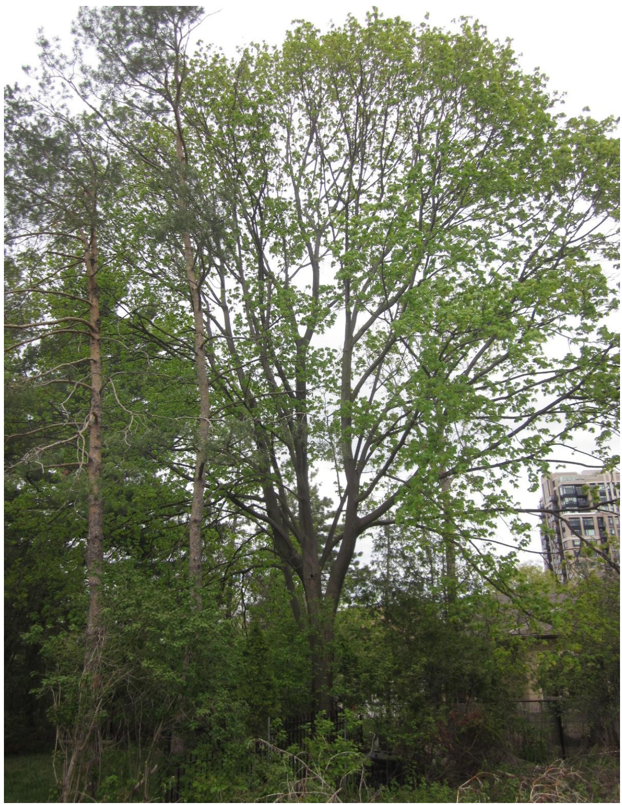
Picture 2. Tree #3, neighbouring Norway maple adjacent to 75 Aylen Avenue.