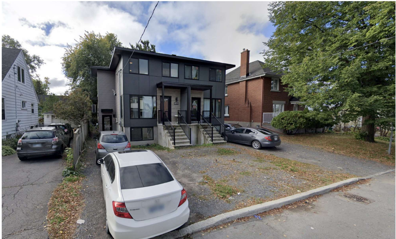
Figure 4 – Existing 4 Unit Recent Development at 1220 Ridgemont Avenue