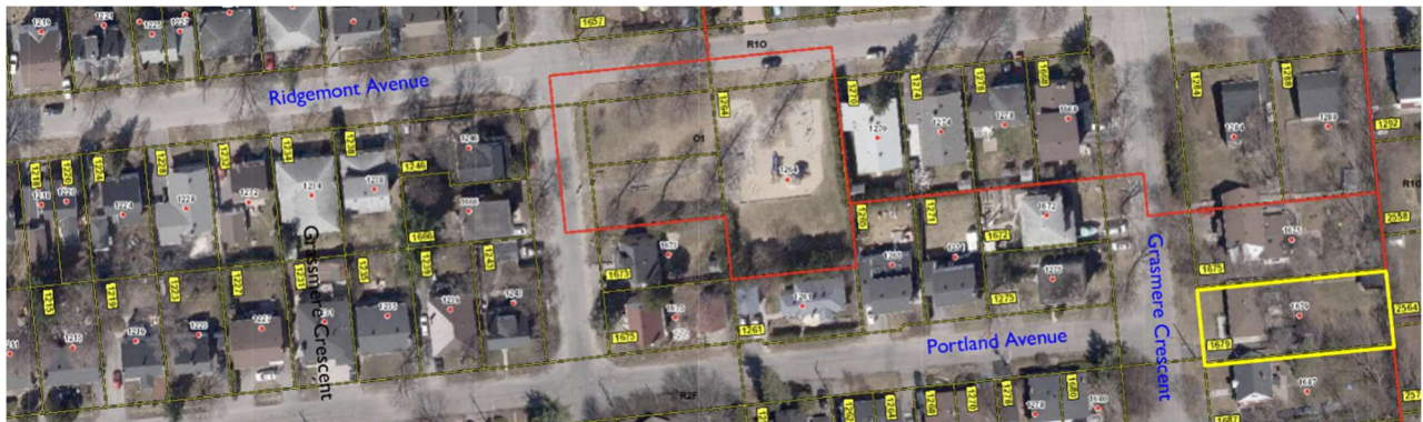
Figure 1: Aerial view of the subject property, 1679 Grasmere Crescent

The subject property is an interior rectangular lot located on Grasmere Crescent at the end of Portland Avenue. The lot is approximately 418 sqm and currently contains a one storey detached residential dwelling.