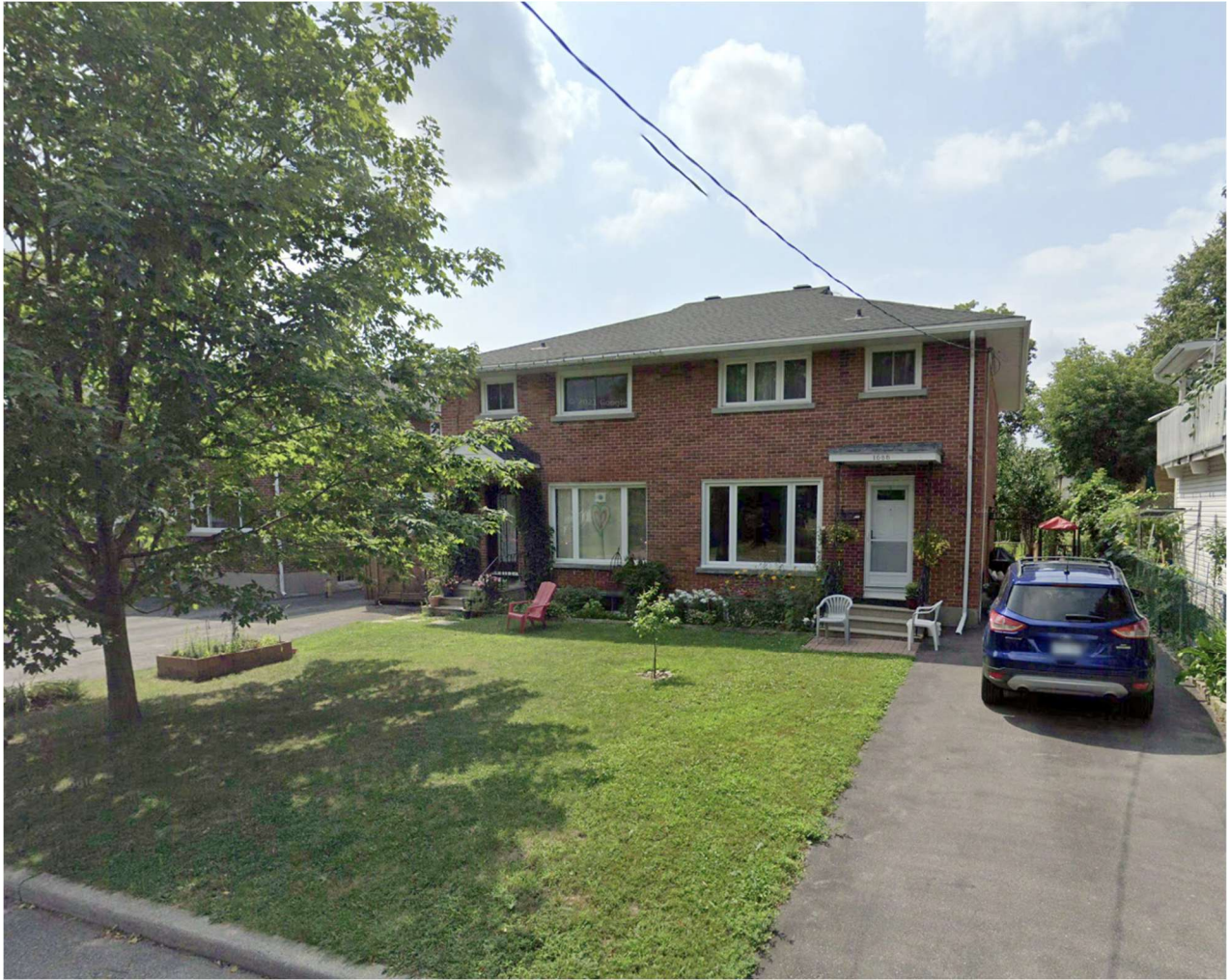
Figure 5 – Existing Duplex with Side Entrances at 1686 Grasmere Crescent