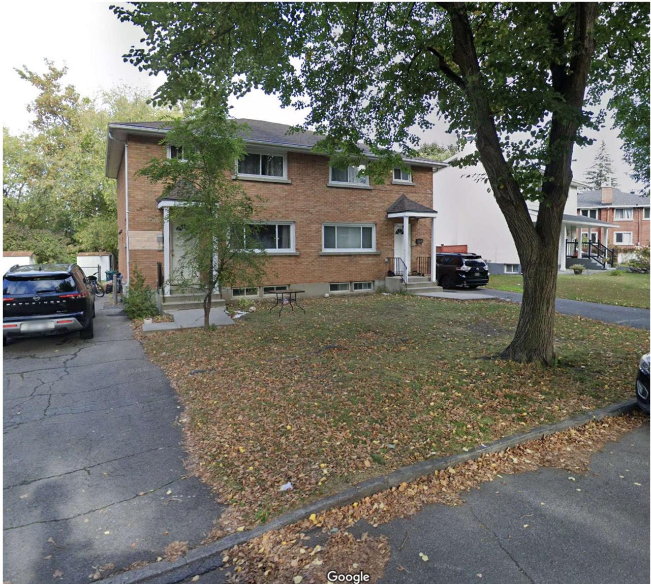
Figure 6 – Existing Duplex 1720 Grasmere Crescent