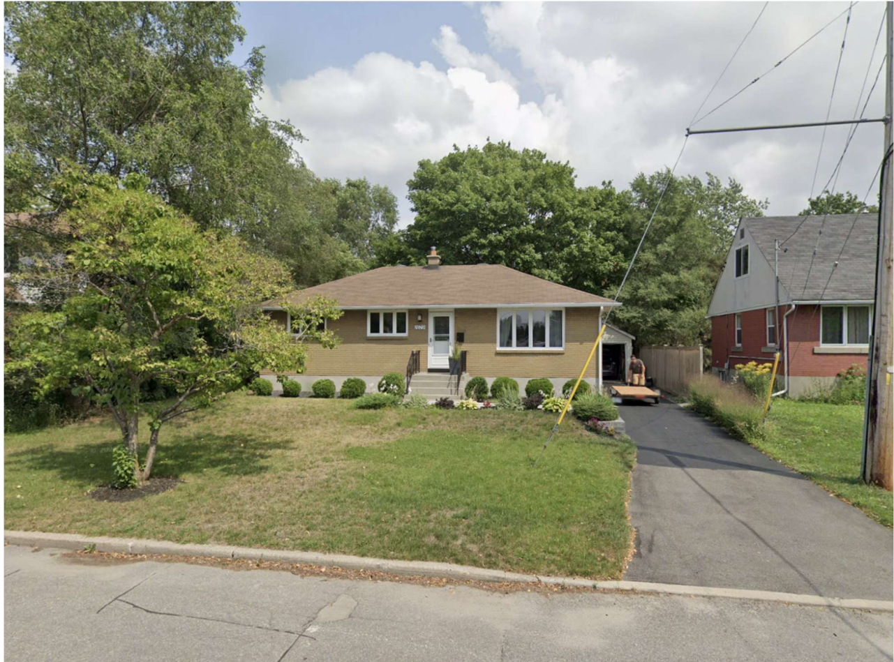
Figure 3 – Existing Dwelling at 1679 Grasmere Crescent

Figure 3, below, shows the existing house today at 1679 Grasmere Crescent. On Ridgemont Avenue there is currently a 4 Unit recently developed lot along with existing duplexes with side entrances at 1686 & 1720 Grasmere Crescent.