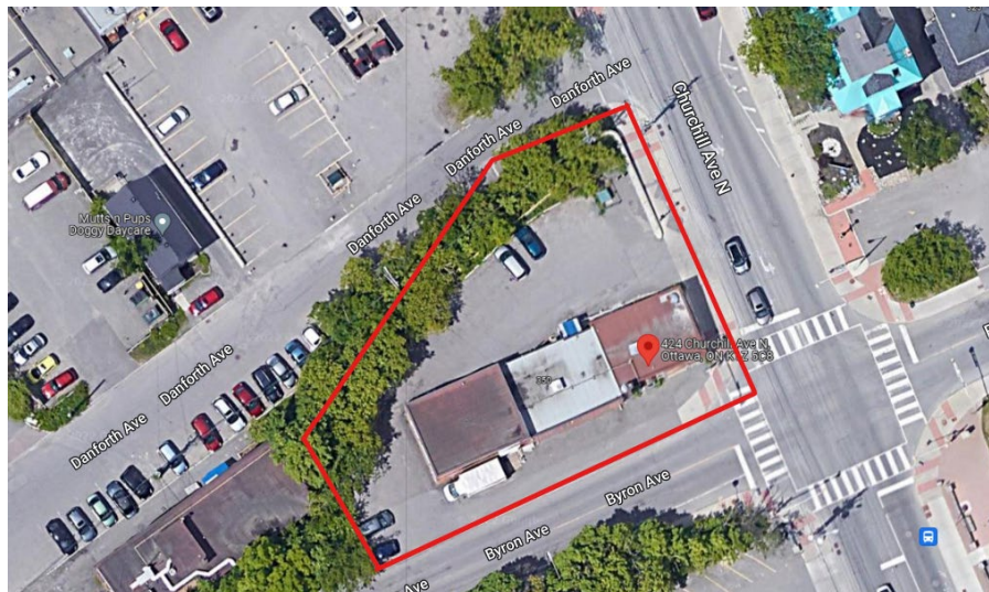
Figure 1: Aerial Imagery of Study Area (Google Earth image)

The property at 424 Churchill Avenue North is bounded by Byron Avenue to the south and Danforth Avenue to the north, refer to Figure 1. A total of thirty-five (35) trees were inventoried within the subject property boundary and another four (4) trees located on adjacent properties or at the boundary edge that were reviewed within the overall Study Area. The trees reviewed consisted of only deciduous species. Several of the species are non-native or invasive species. There are isolated native species intermixed on the property. The trees are located primarily along north side of the property below a retaining wall that extends through the subject property.