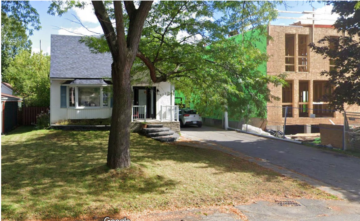
Figure 3, below, shows the existing 1.5 storey dwelling at 655 Donat Street. It is important to note that the existing tree at the front of the property will be preserved.