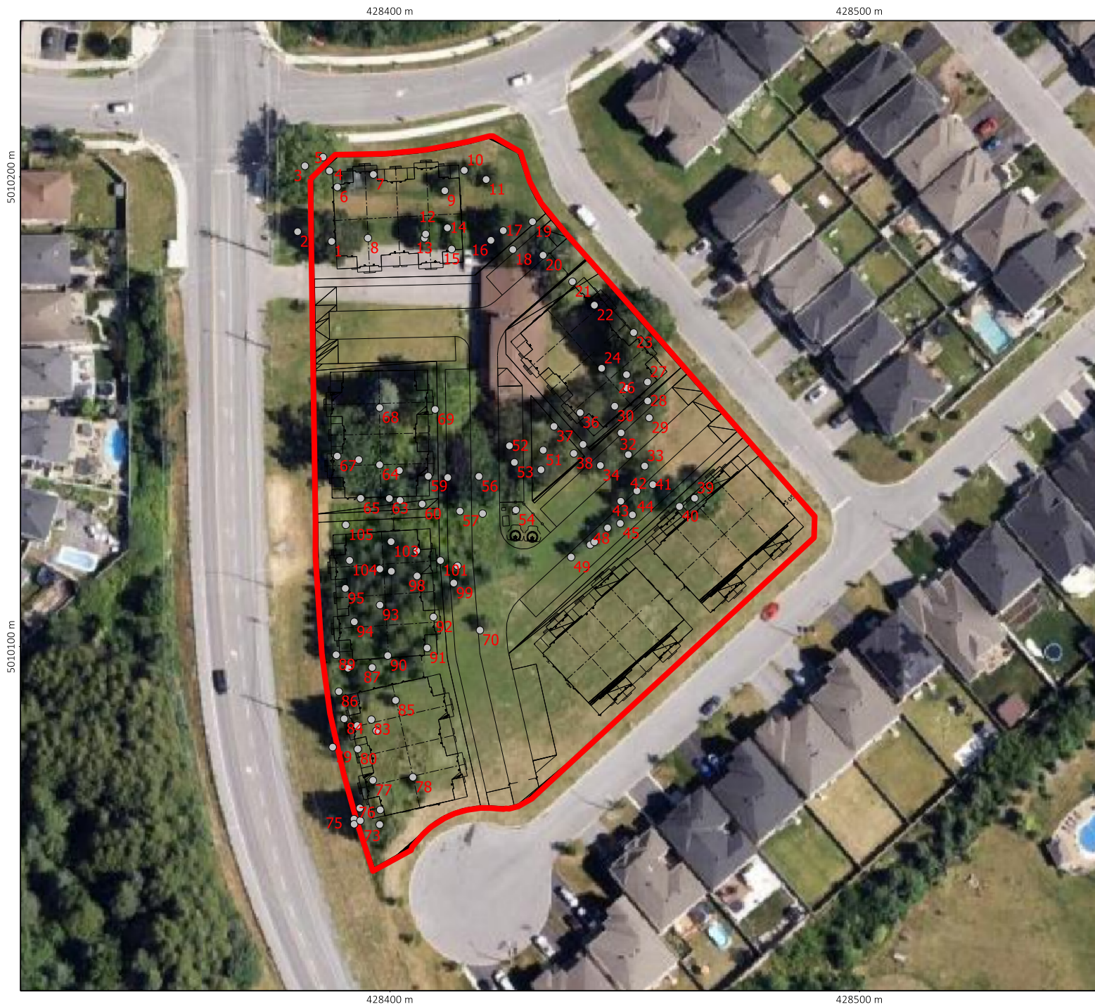
Figure 2 Tree Results Following Excavation