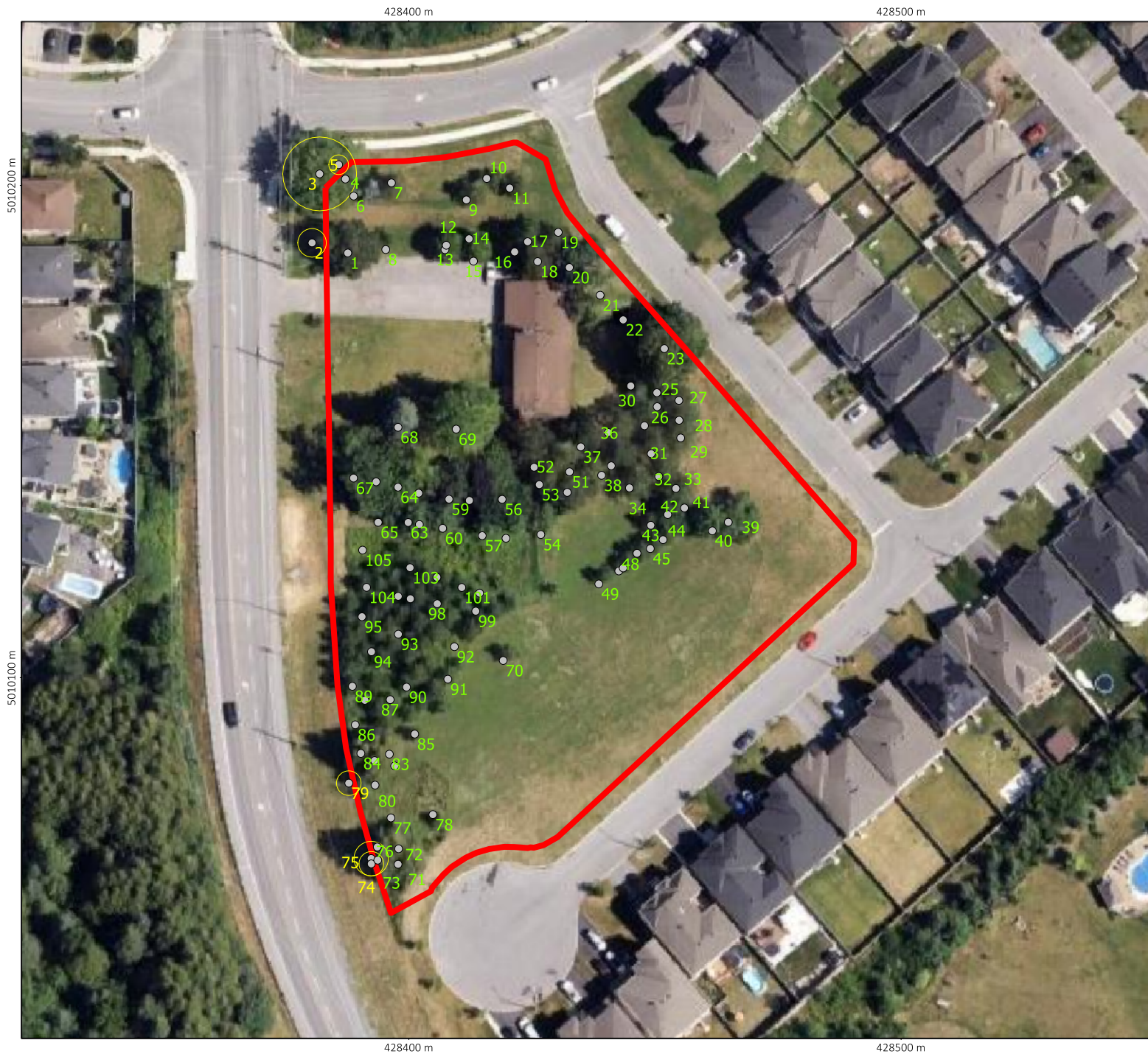
Figure 1 Tree Locations