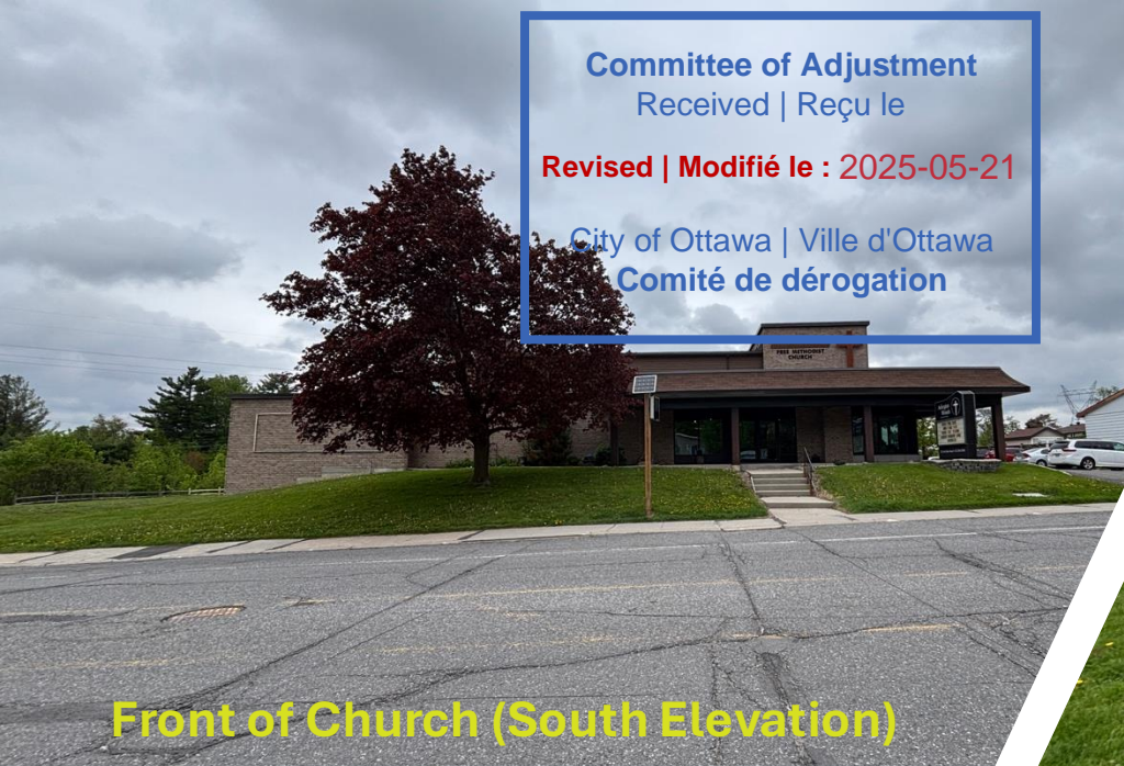
Front of Church (South Elevation)

Committee of Adjustment Received | Reçu le Revised | Modifié le : 2025-05-21 City of Ottawa | Ville d'Ottawa Comité de dérogation