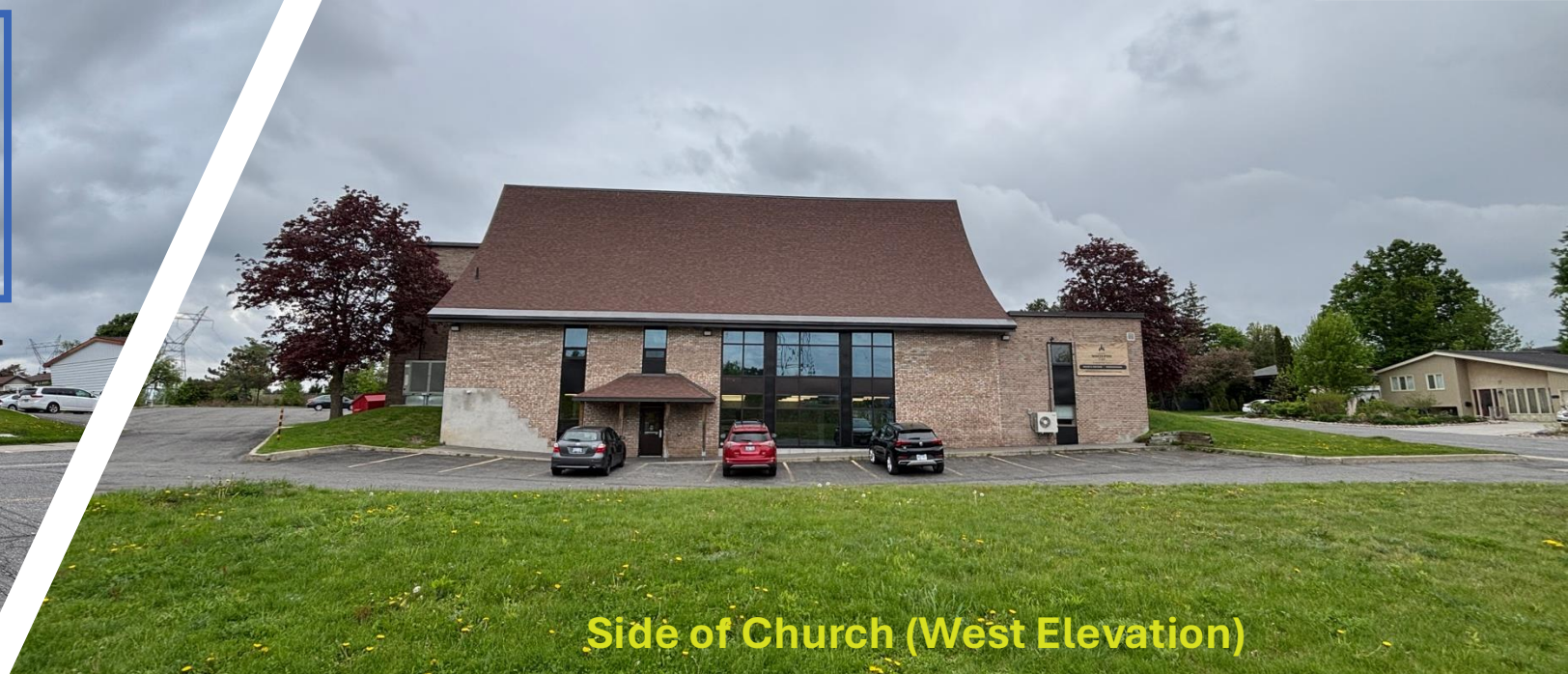
Side of Church (West Elevation)