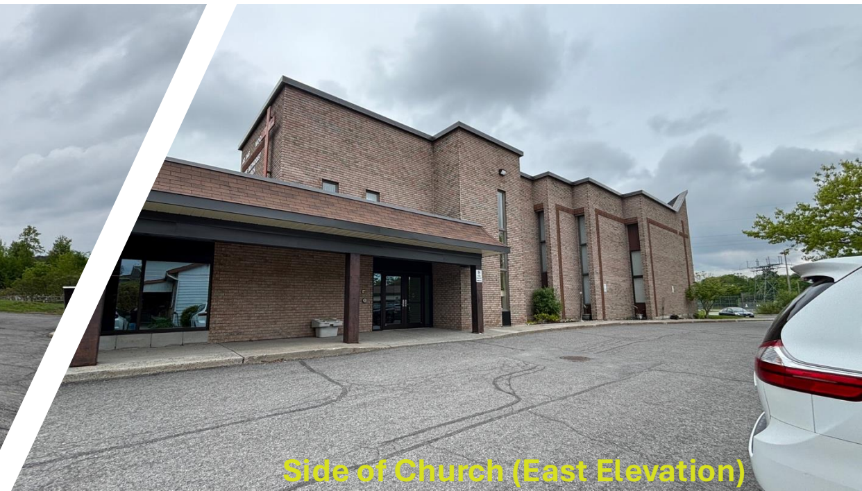
Side of Church (East Elevation)