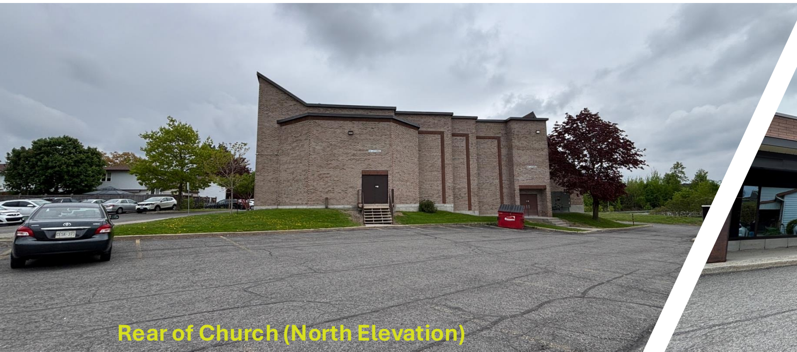
Rear of Church (North Elevation)