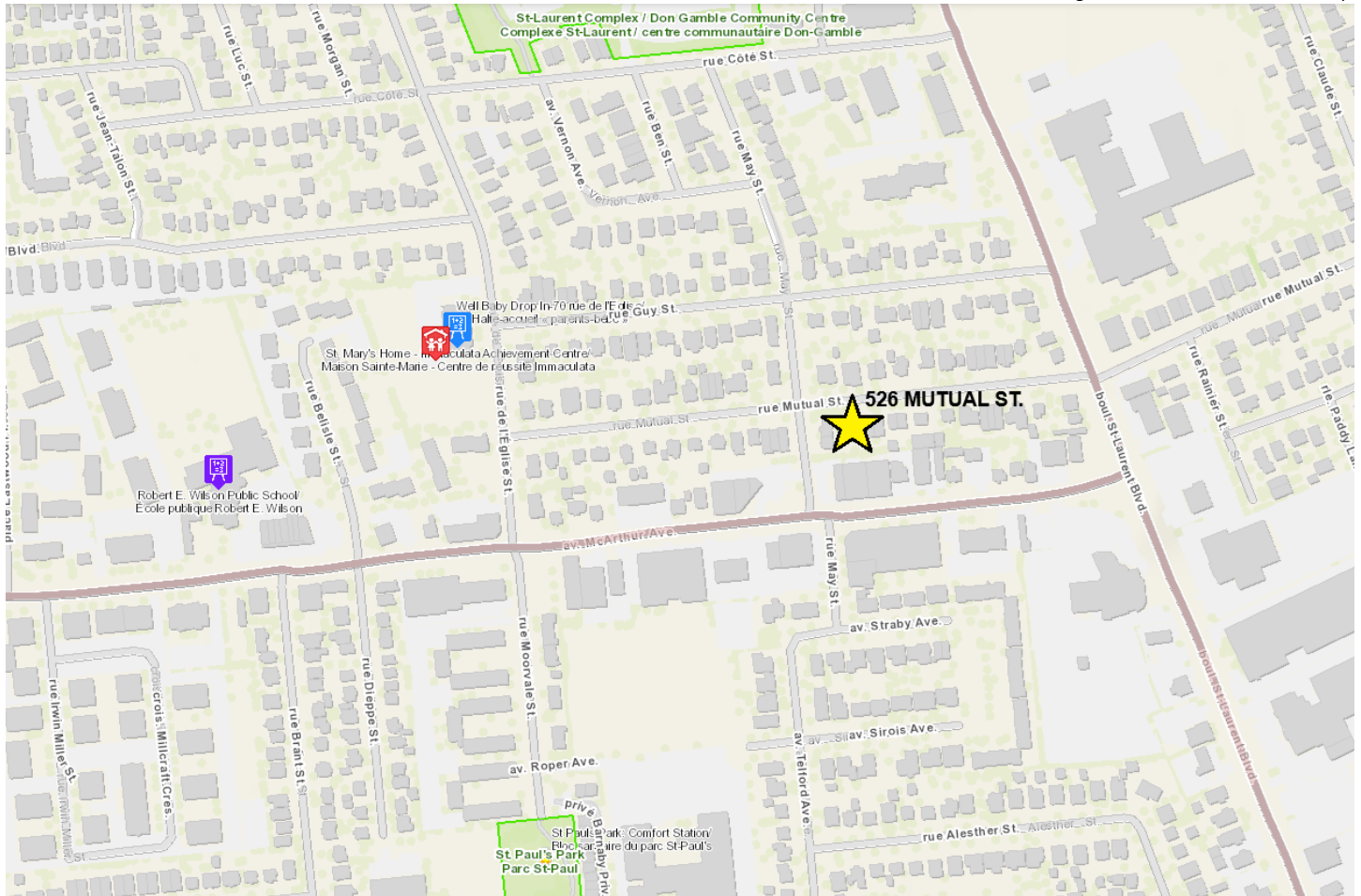
Figure 3: Site Location Map

The Vanier South Community was generally built as mixed land use (single, semi, and duplex dwellings) residential neighborhood in the mid 1940s-1950s. Housing along Mutual Street was characterized by 1-storey single dwellings. The replacement of the existing 1-storey dwellings by larger 2-storey singles, semi-detached dwellings and townhouses has occurred throughout this area in the last 5 to 10 years to maximize residential development on these lots. Many of these new dwellings utilize the maximum allowable building envelope and building height.