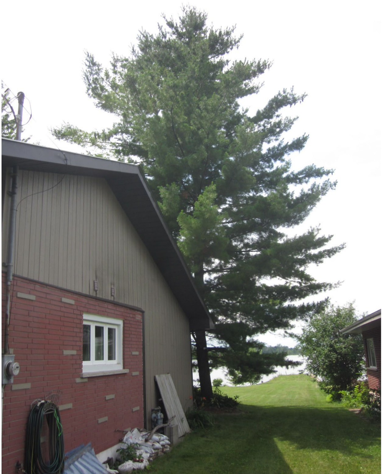
Picture 3. Tree #4 at 9 Hastings Street – neighbouring white pine to be retained.