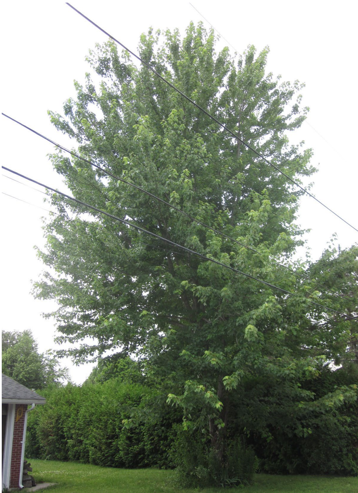
Picture 1. Tree #1 at 9 Hastings Street – private Freeman maple to be removed.