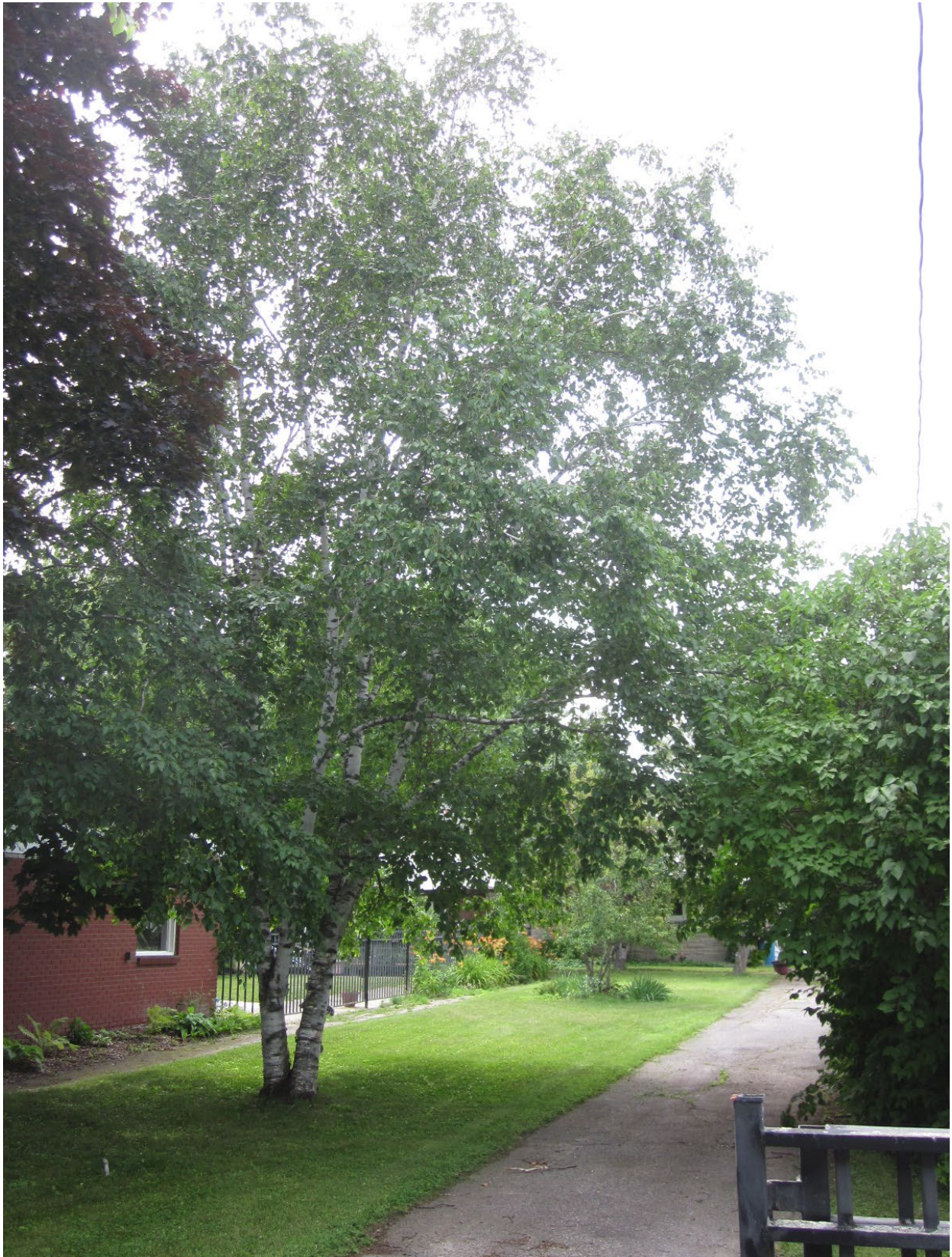
Picture 2. Tree #2 at 9 Hastings Street – neighbouring white birch to be retained.