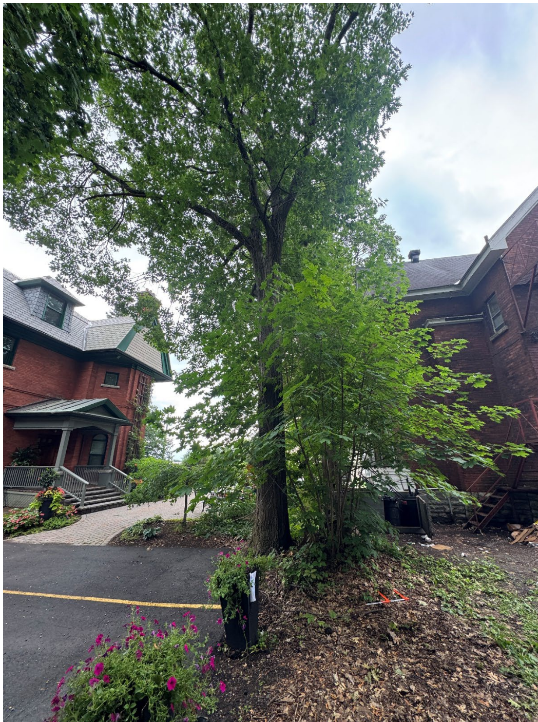
Figure 1: Tree 1, red oak on adjacent property