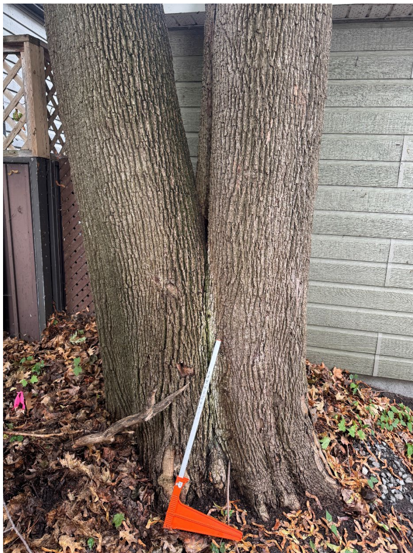
Figure 3: Tree 4, Norway maple on adjacent property, poor union at base with included back and some separation