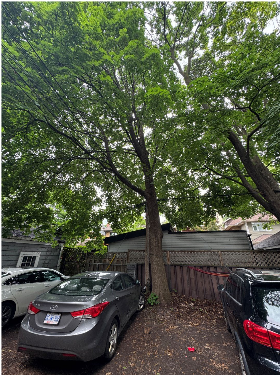
Figure 4: tree 5, Norway maple at the rear of the property. Note the current parking area and compacted soils