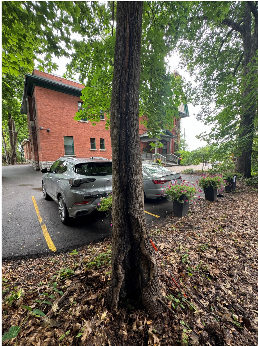
Figure 2: base of tree 2, note large wound on the upper side of the lean