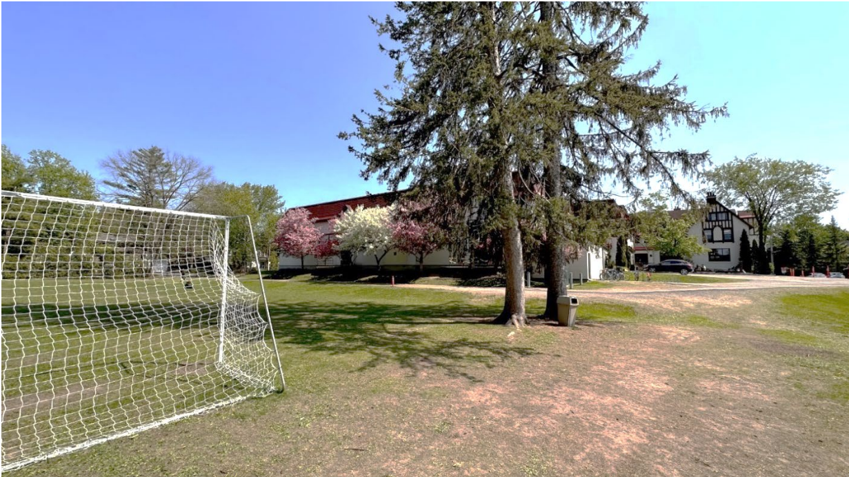
Existing view facing southeast