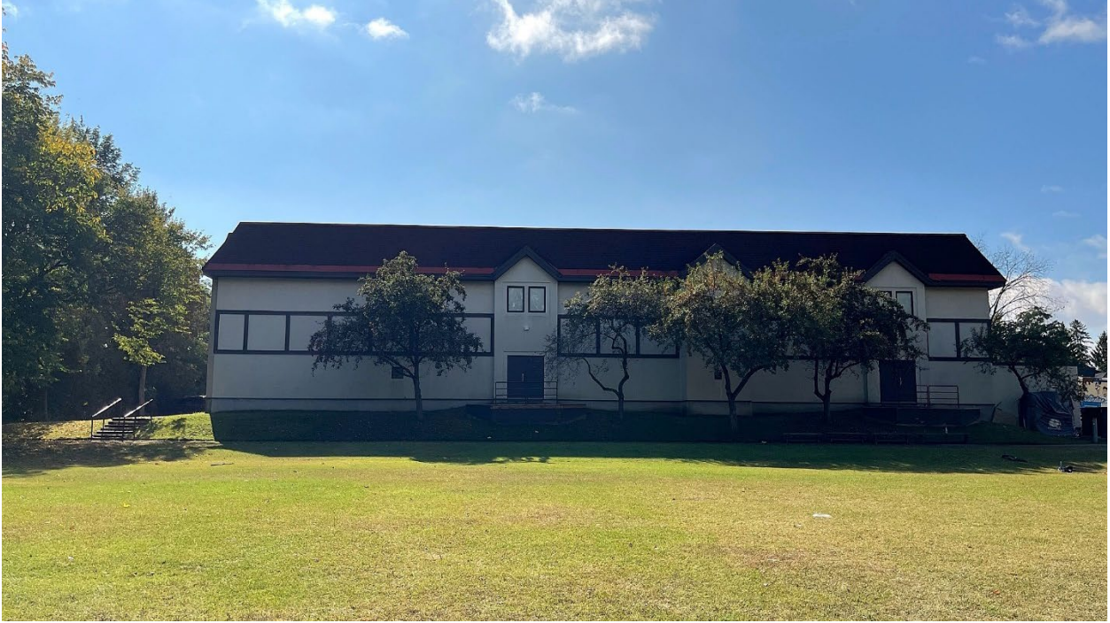
Existing view of north / rear façade