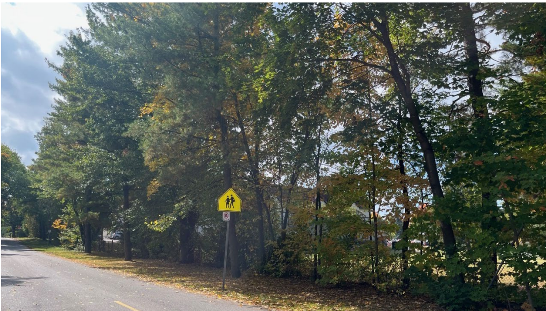
Existing view looking east from Springfield Road