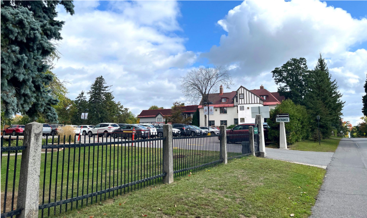
Existing view from Buena Vista Road, Facing Northeast