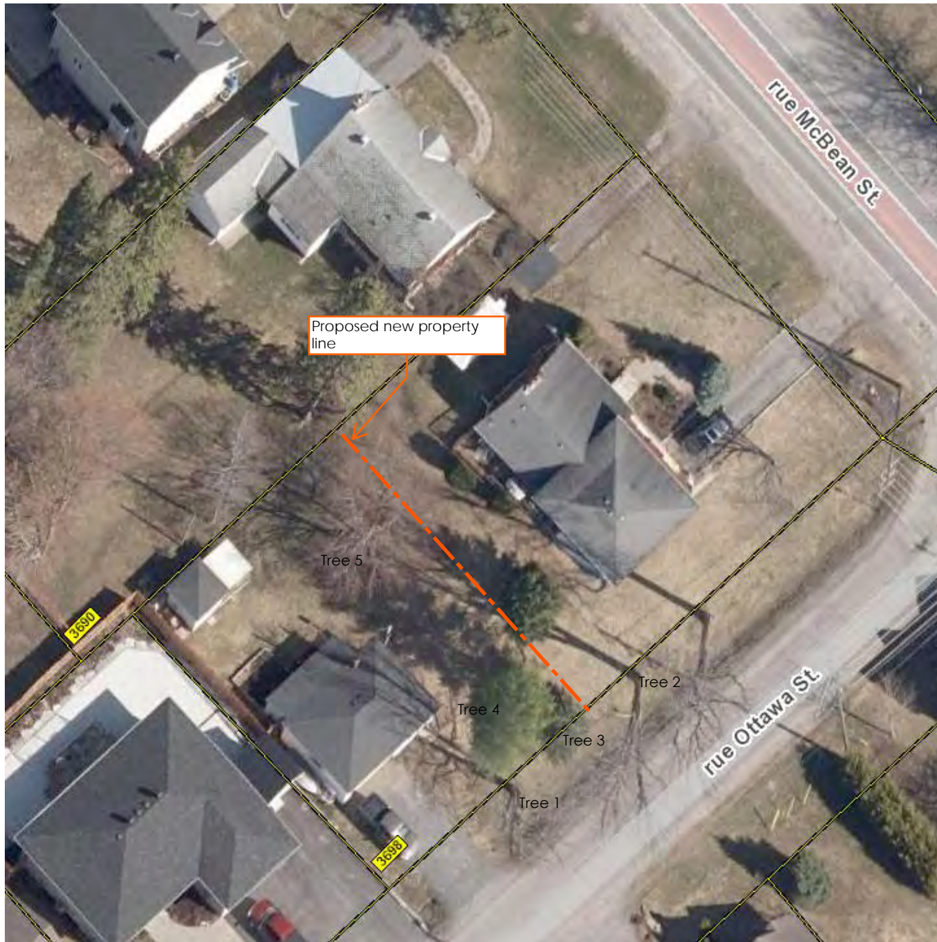
Tree Information Table