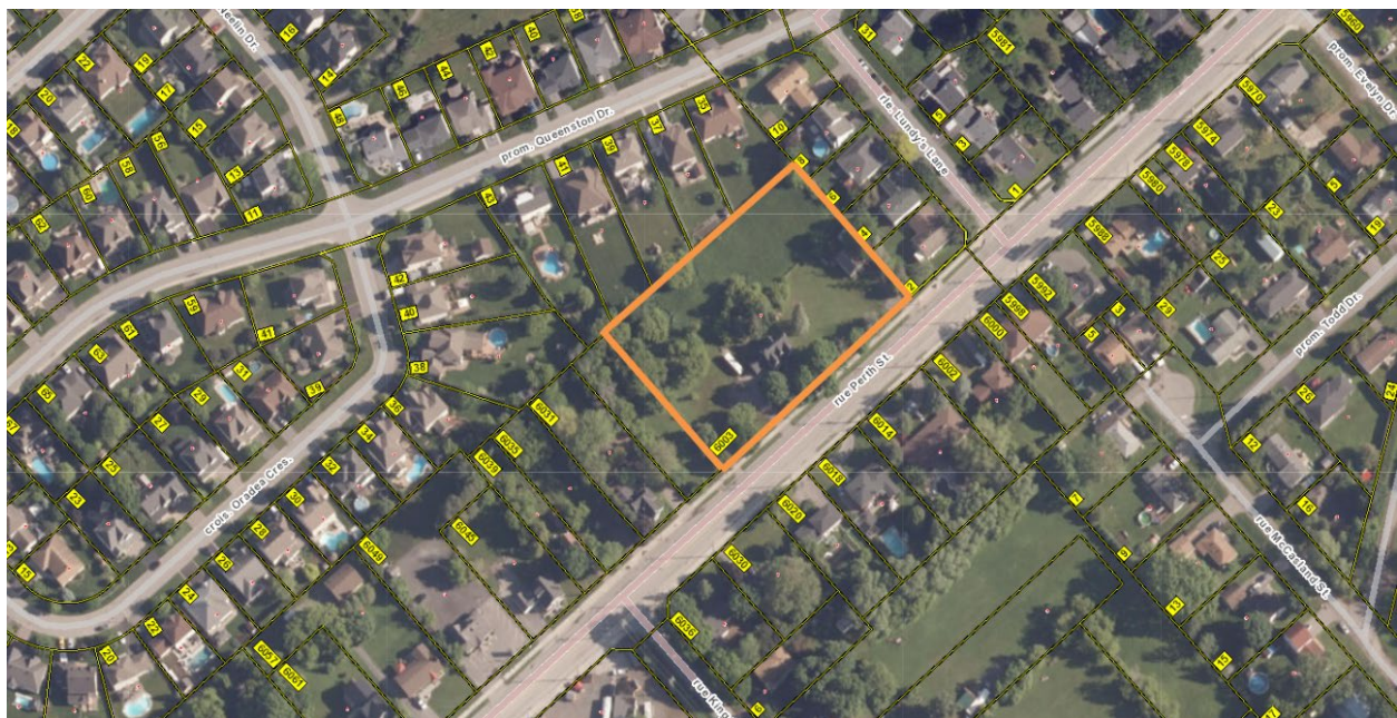
Figure 1 – Aerial View of Subject Property at 6003 Perth Street

As seen in Figure 1, the other surrounding land uses predominantly consists of residential and local commercial.