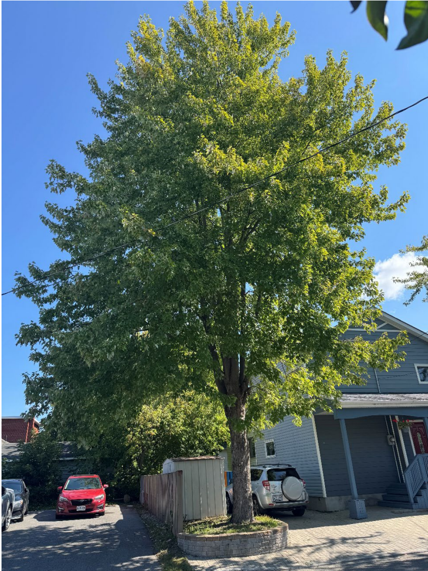
Figure 1: Silver maple on adjacent property