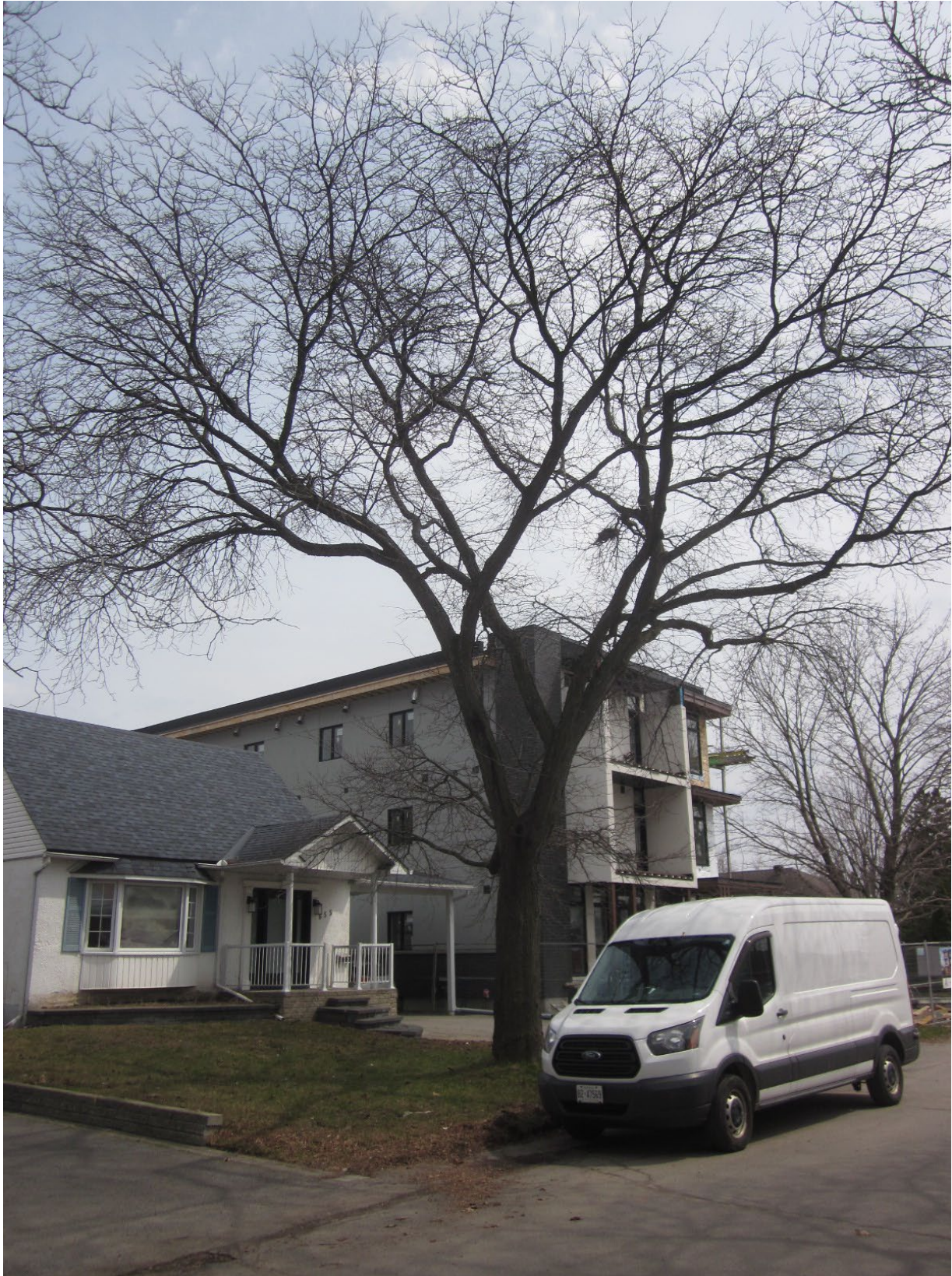
Picture 1. Tree #1 – Honey-locust on City of Ottawa land at 665 Donat Street.