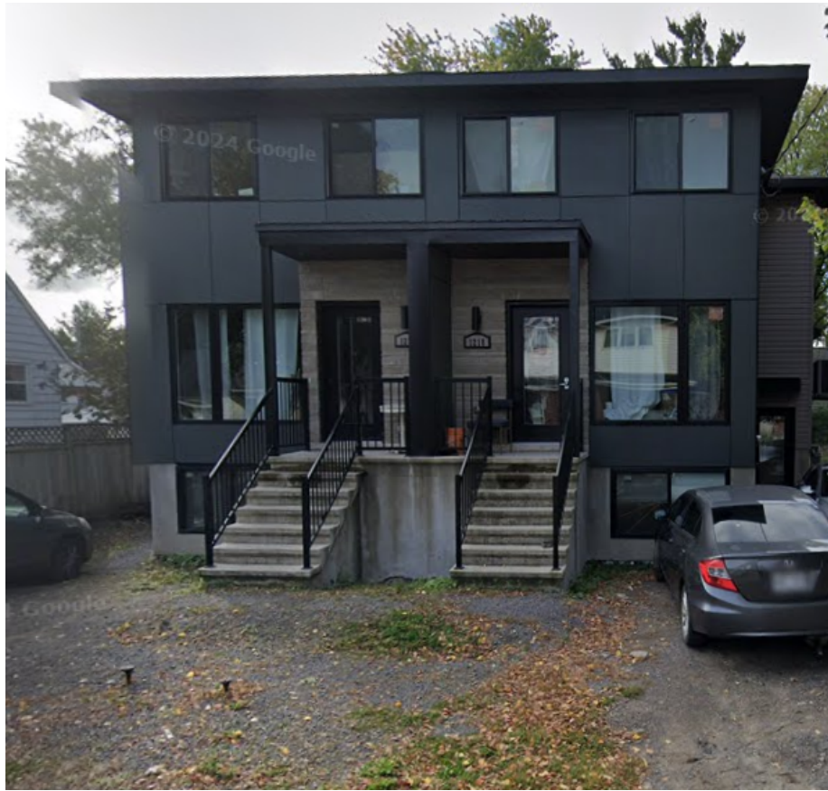
Figure 3- Semi-Detached Dwelling 1218/1220 Ridgemont Avenue (R2F Zoning)