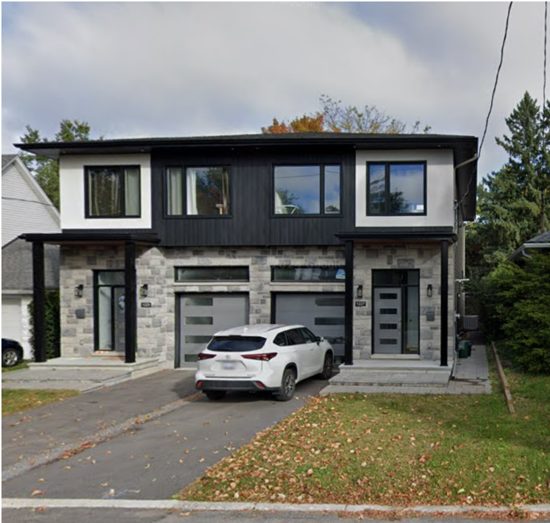
Figure 2- Semi-Detached Dwelling 1225/1227 Ridgemont Avenue (R2F Zoning)