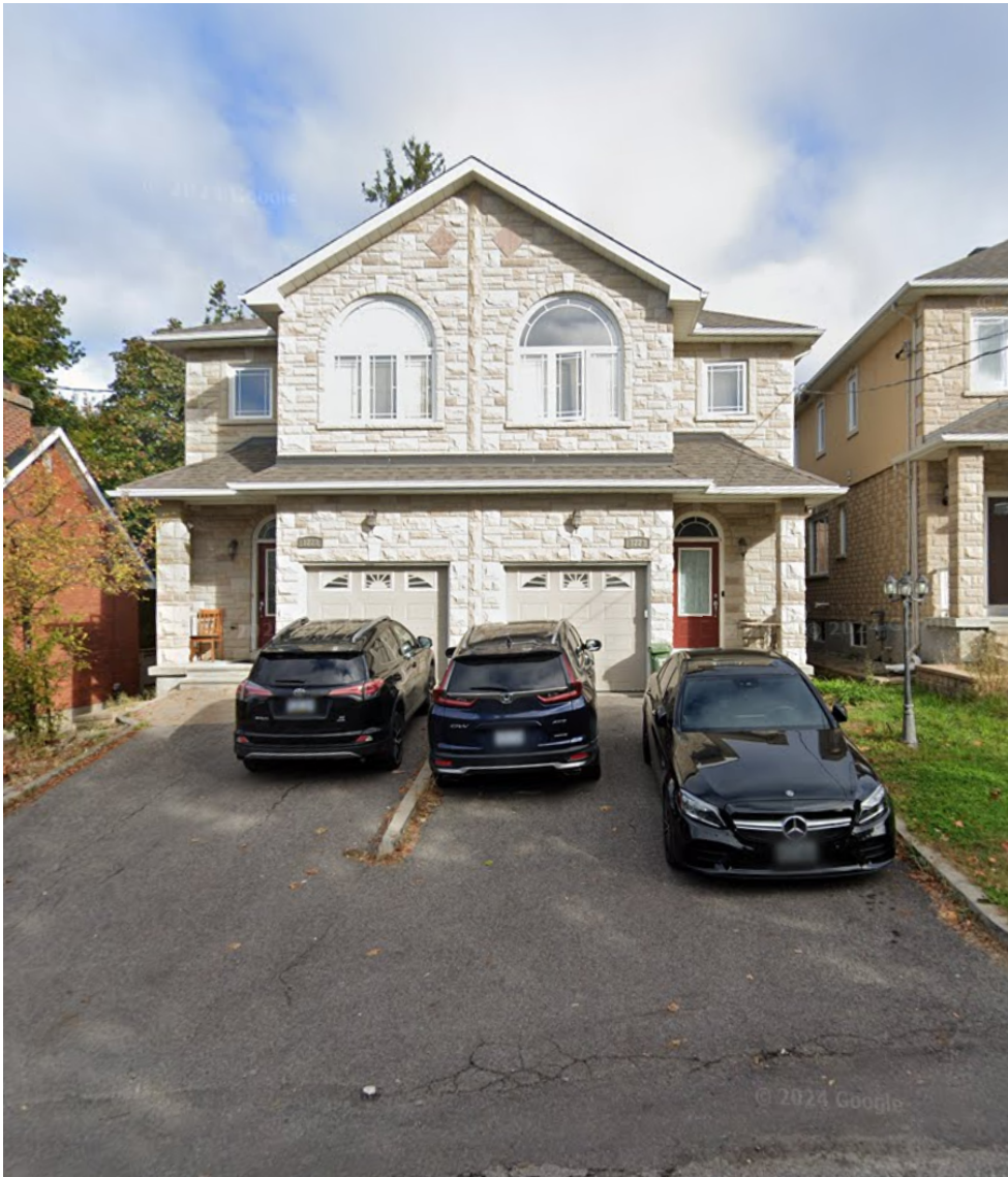
Figure 2- Semi-Detached Dwelling 1221/1223 Anoka Street (R2F Zoning)