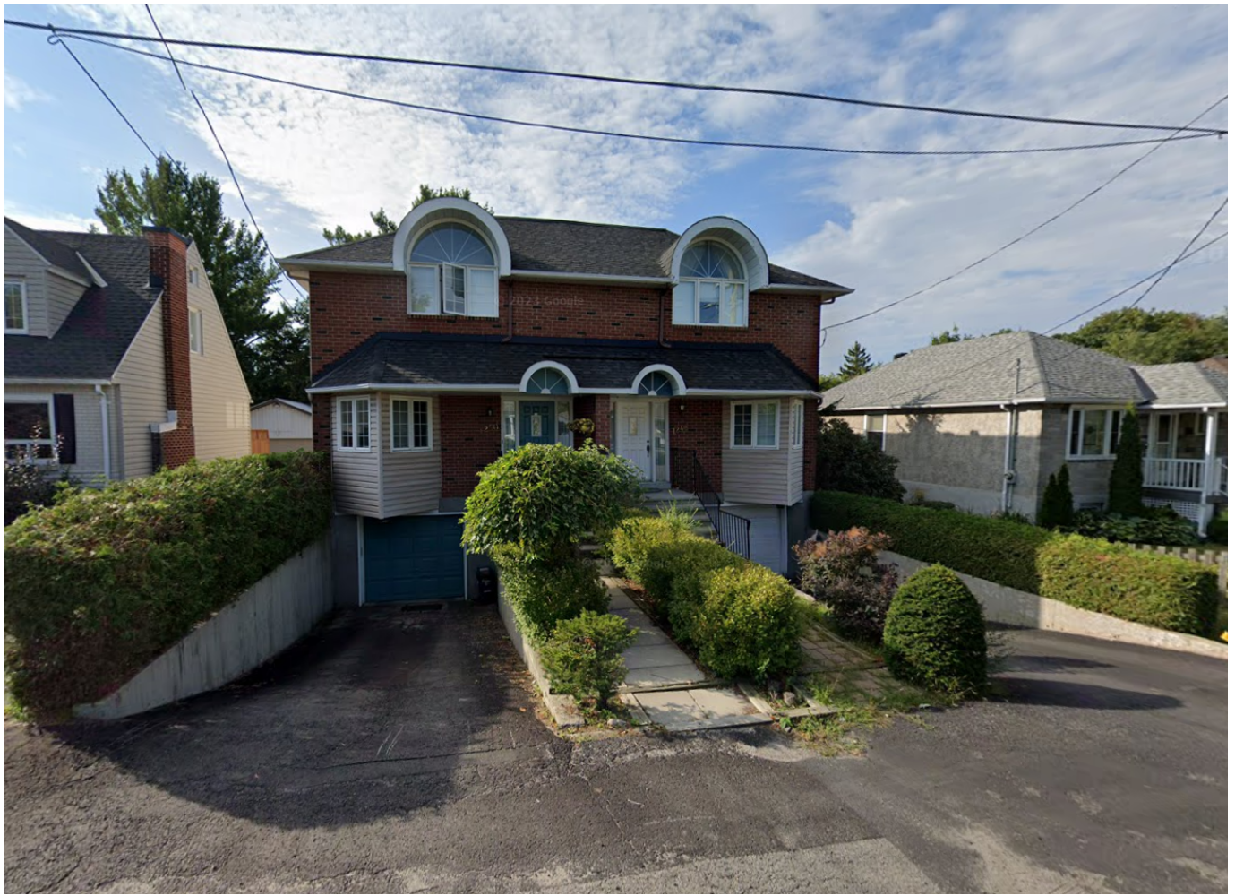
Figure 3- Semi-Detached Dwelling 1248/1250 Anoka Street (R2F Zoning)