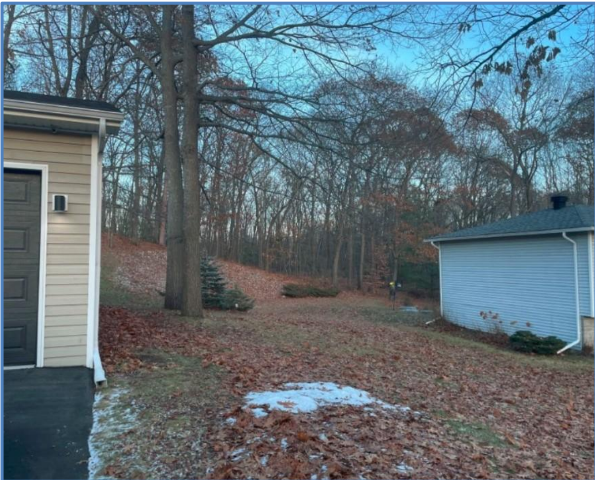
Figure 3: Space between garage and adjacent house at 182 Archie Street

The function of the interior side yard setback is maintained. Adequate space is available to control the flow of stormwater as confirmed through the grading plan submitted with the building permit. The private individual services on the subject property remain in good working condition and can be accessed for periodic maintenance.