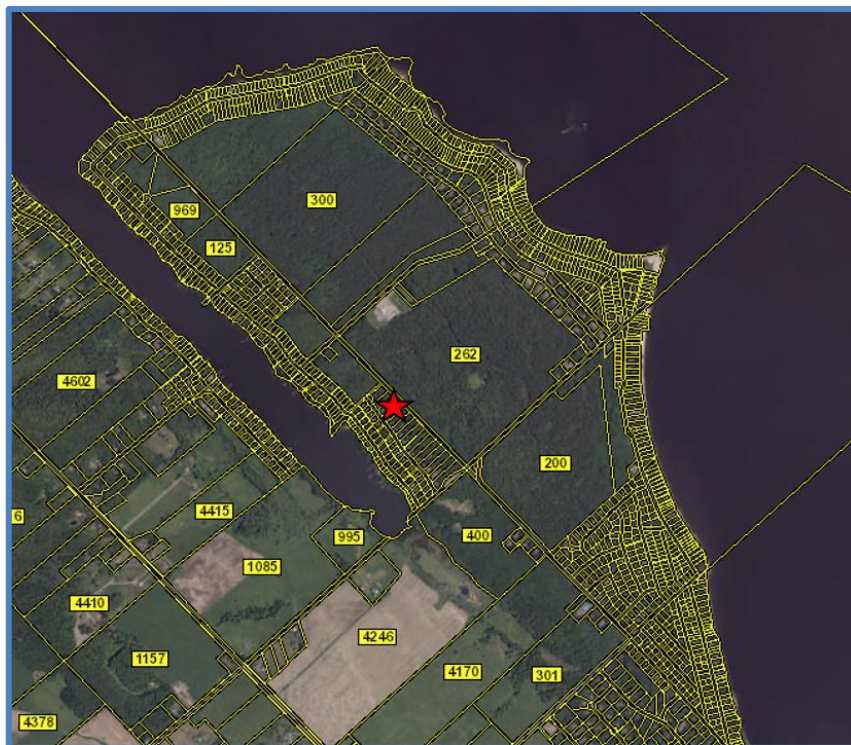
Figure 1: Location of 190 Archie St

The property is municipally known as 190 Archie Street and is located in the Village of Constance Bay in Ward 5 (West Carleton-March). The property is legally described as Lot 3 on Plan 4M-673, City of Ottawa. The property is an irregular shaped block with a total area of 4,344 square metres and a frontage on Archie St. Figure 1 shows the location of the property.