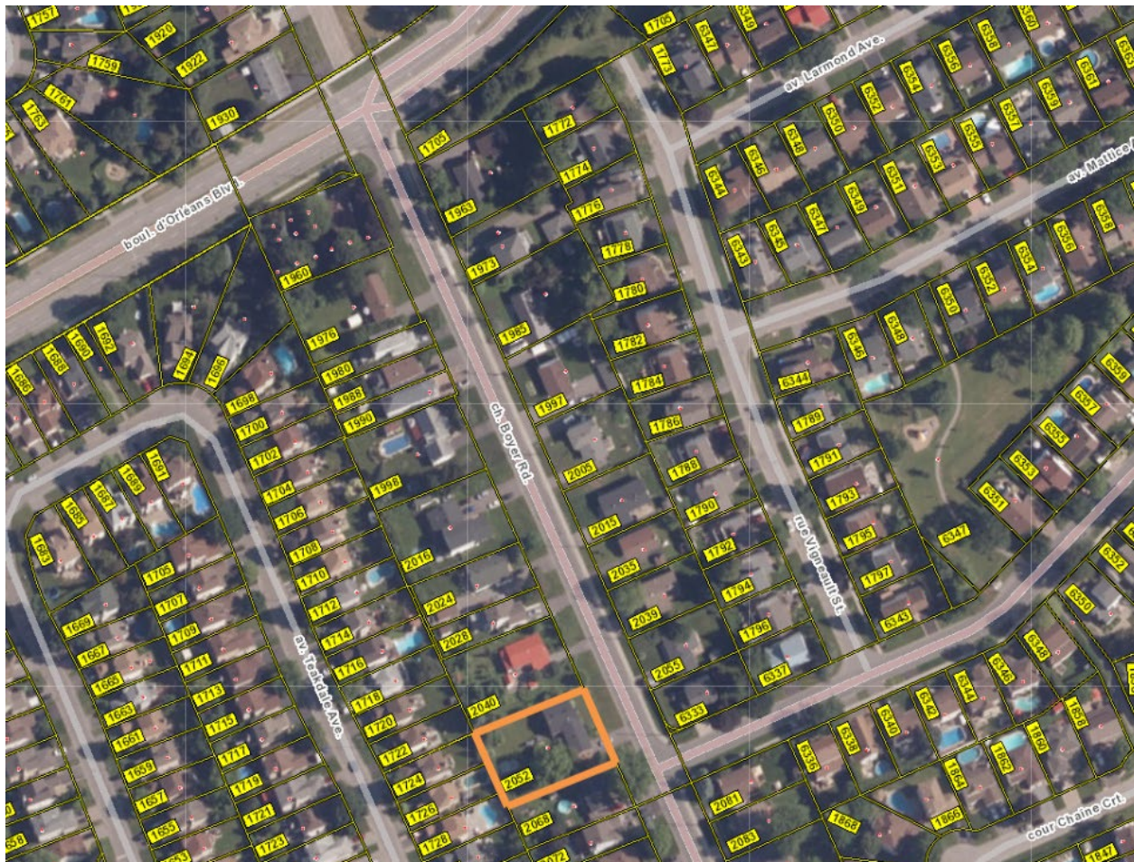
Figure 1 – Aerial View of Subject Property

Figure 1 shows an aerial view of the subject property outlined in Orange. As shown in the aerial image, the surrounding land uses are predominantly residential.