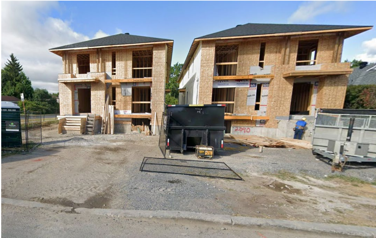
Figure 6 – 2094 Boyer Road under construction with two long semidetached units.

1960 Boyer Road has recently been severed under File Number D08-01-25/B-00113 & D08-01-25/B-00114 to permit a long semidetached and semidetached unit.