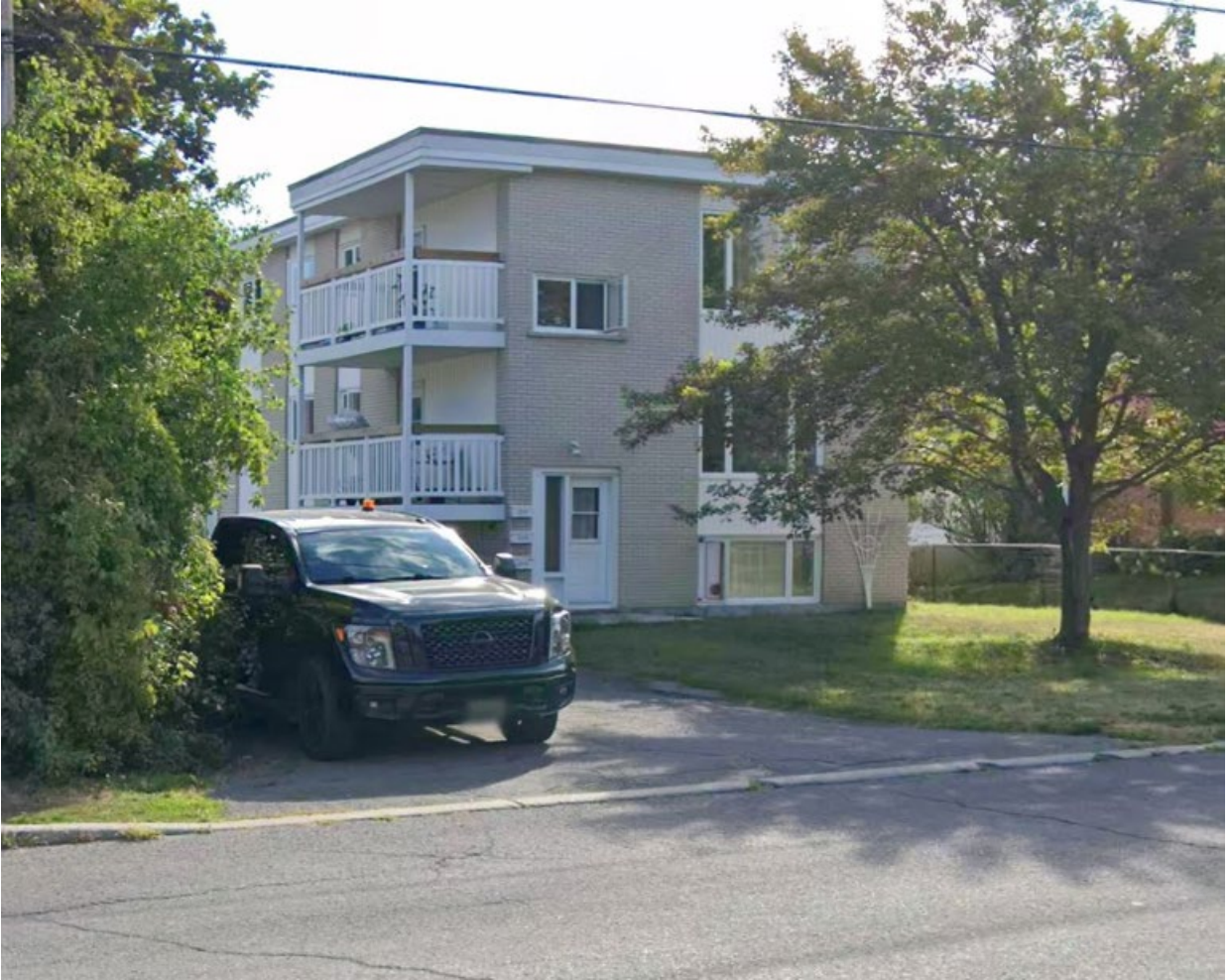
Figure 5 – Low-rise multi-unit development at 2113 Boyer Road