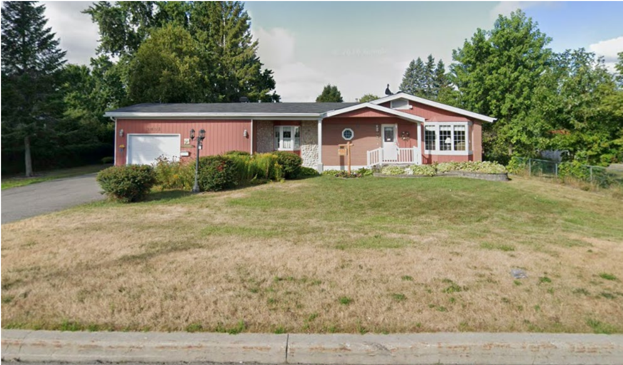
Figure 4 – View looking at the subject property from Boyer Road; 2052 Boyer Road.

This area has been subject to intensification in recent years given the large lot sizes, proximity to services and Major/ Minor corridors.