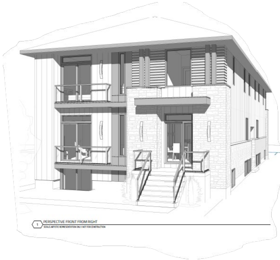
Figure 3 – Perspective from Right of the Front Elevation