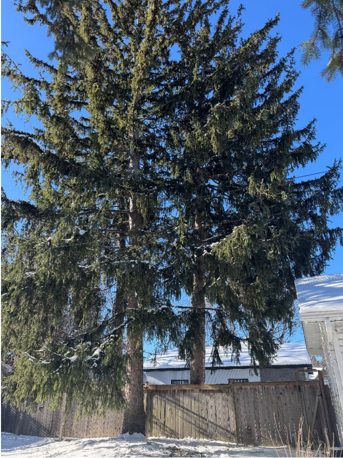
Picture 2: From left to right, trees 4, 3 and 5, privately owned Norway spruces