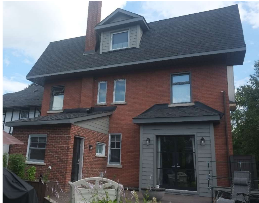
Fig. 18: After – Consistent and uniform appearance