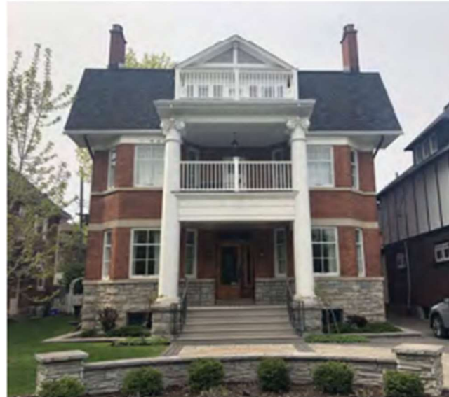
Fig. 2: Picture from HDCP circa 2019

Changes that have occurred between 2005 and 2009: