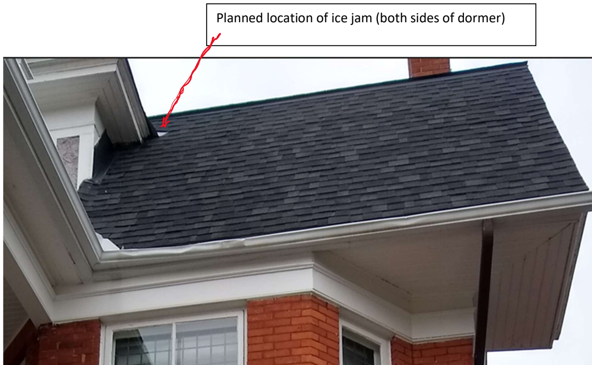
Fig. 16: Eavestroughs damaged from ice sliding down from above