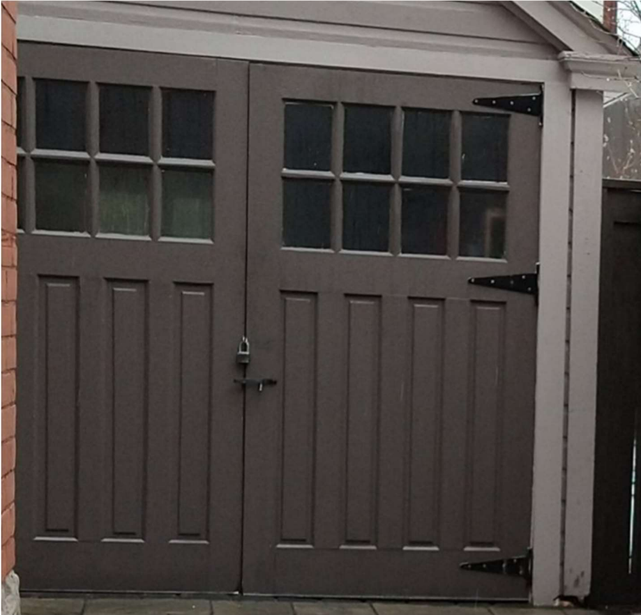
Fig. 21. Garage doors were replaced by then owner in the 1990's as original doors were finished. Doors swing sideways and cannot be opened during the winter months due to frost heave of the driveway in front of the garage. Doors were cut 2 inches last year to attempt to correct issue, but another 2 inches would need to be cut from the bottom so that they could swing open properly.