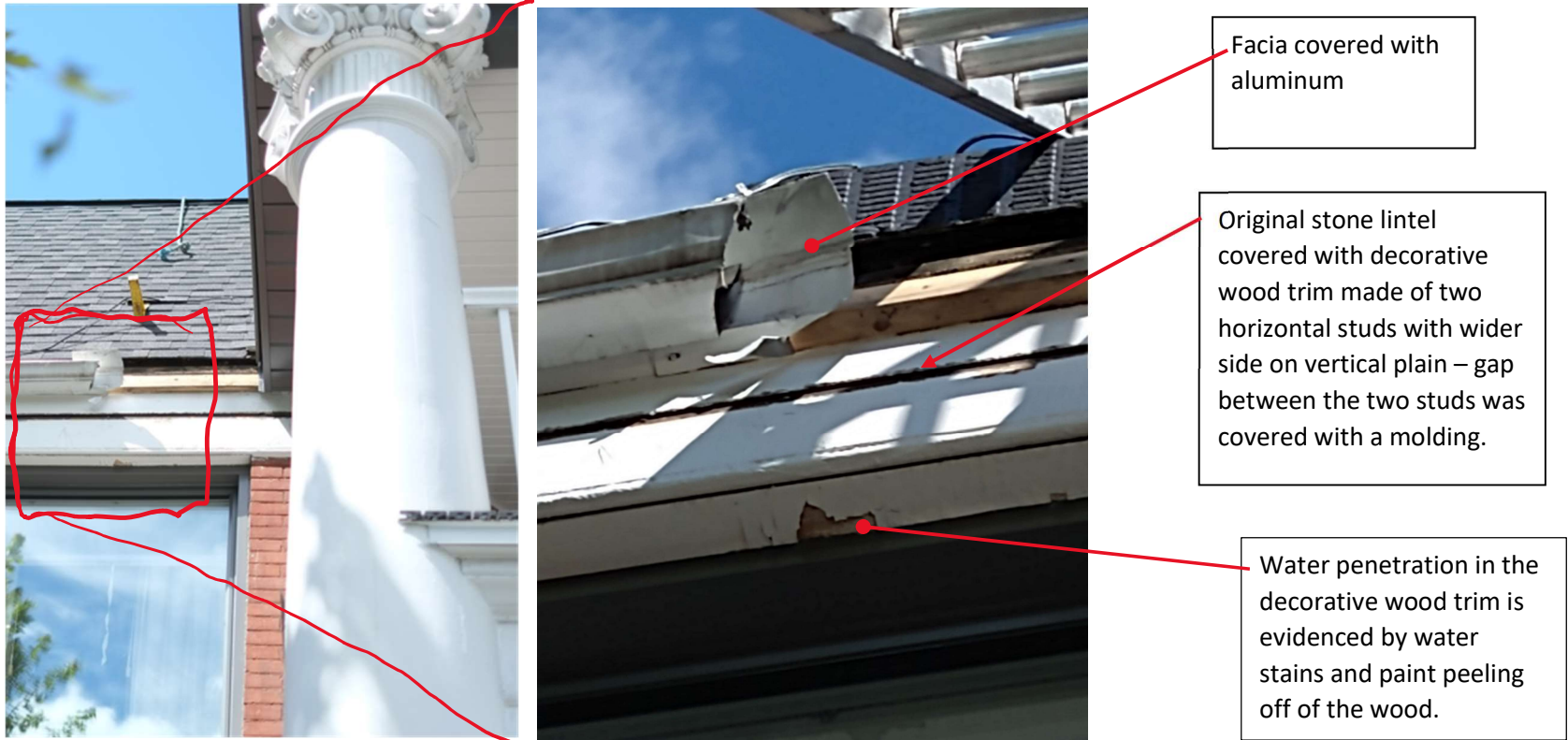
Fig. 8 and Fig. 9: Front of house – upper fascia and decorative trim above 2 nd floor windows: Photo shows that fascia was covered with aluminum. Rain gutter was also installed. Water penetration is evident. Long term concern is water damaged wood will attract infestation of insects such as carpenter ants.