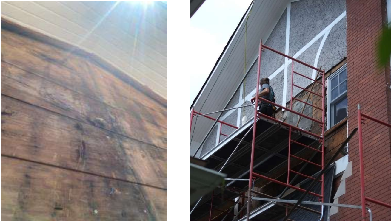
Fig. 6 and Fig. 7: Exposed boards after stucco panels were removed