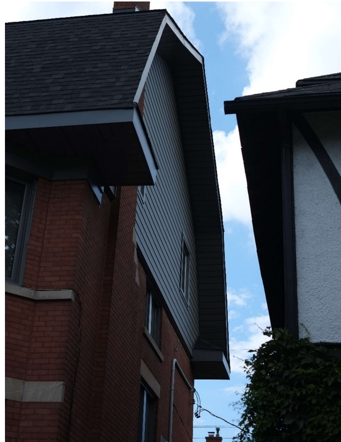
Fig. 20: After