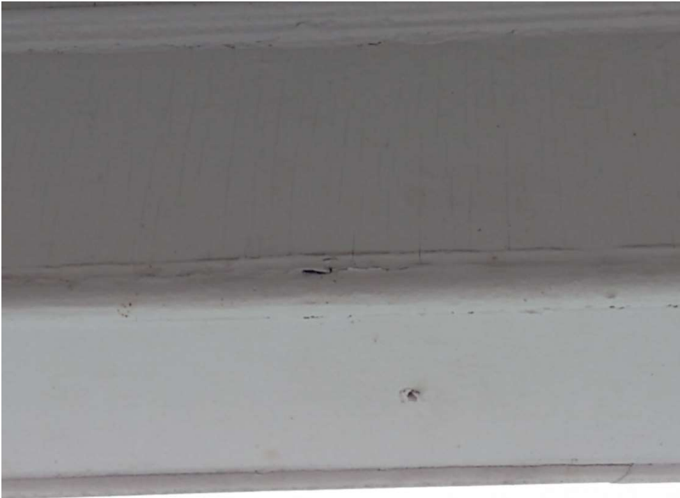
Fig. 15: Underside and inside vertical side of beam under 2 nd floor balcony looking out away from the house. Paint and caulking are lifting in some areas due to water infiltration from above. Area has not been opened yet for inspection.