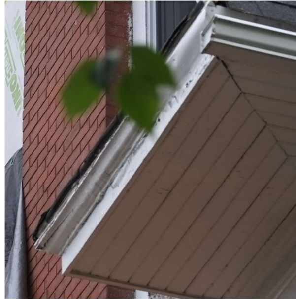
Fig. 10 and Fig. 11: Crown mouldings have deteriorated pass point of repair. Aluminum caps on the end of the crown mouldings are visible in both photos