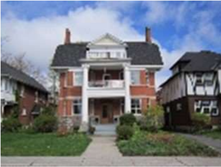
Fig. 1: Picture of the house circa 2005