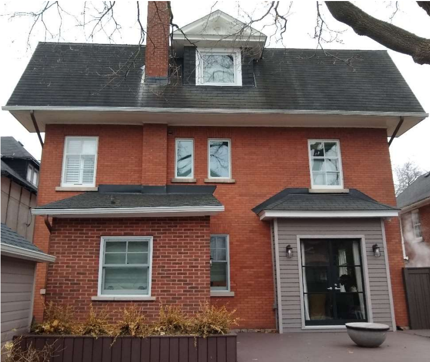
Fig. 17: Before. Asphalt shingles used on dormer