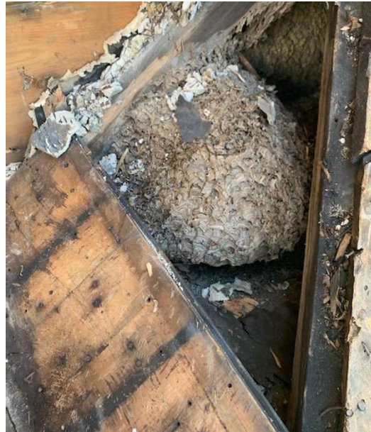
Fig. 12 and Fig. 13: As flashing was not used in original construction, crown mouldings and boards were subject to rot over the years leaving gaps where squirrels, birds and wasps were able to enter and nest