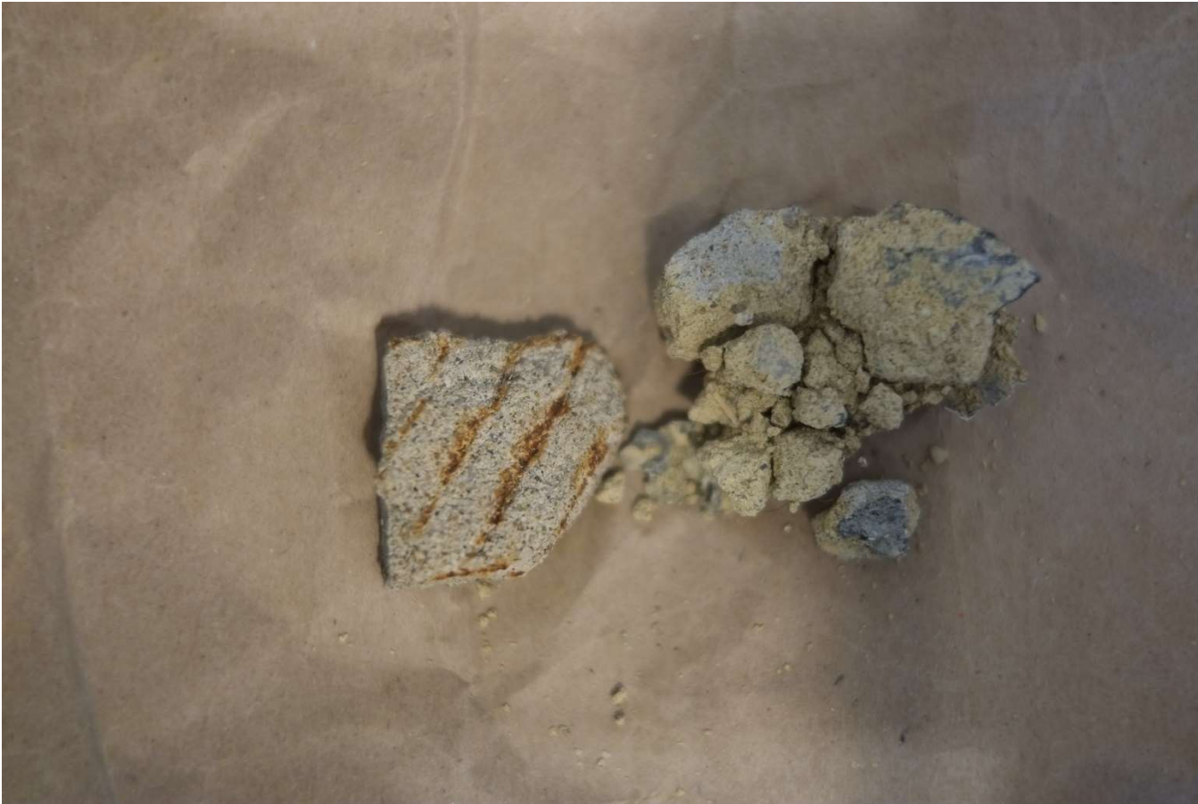
Fig. 3: Stucco substrate is crumbling and separating from rusty support wire mesh. Impossible to remove stucco panels without damaging them.